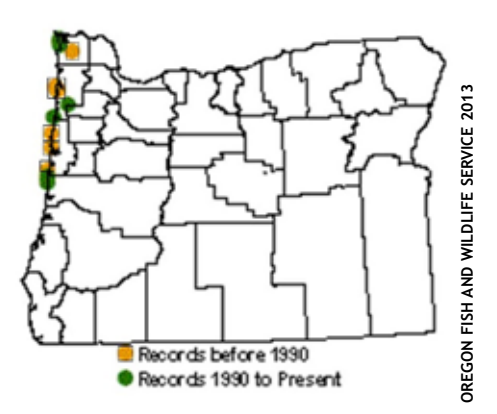
Figure 2. Current populations of the Oregon silverspot butterfly (dark) compared with historic populations (light) in Oregon.

U.S. Fish & Wildlife Service 2013. Species fact sheet: Oregon silverspot Butterfly. Oregon Fish and Wildlife. Accessed: 23 July 2015. http://www.fws.gov/wafwo/species/Fact%20sheets/Oregon%20Silverspot%20Draft%20Final.pdf