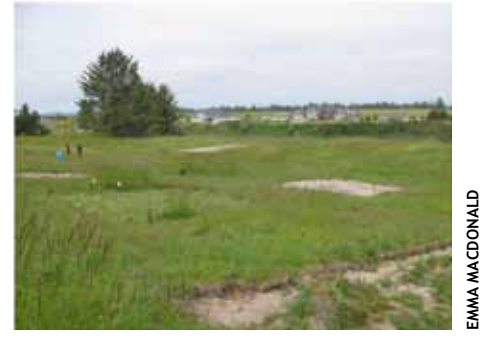
Figure 3. Surf Pines; one study site where all the various treatments can be seen. Foreground to back left: soil inversion, herbicide, soil removal. Control plots are interspersed.