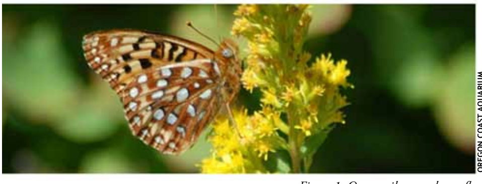
Figure 1. Oregon silverspot butterfly.