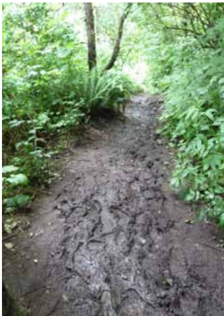
Mud at the Thumb