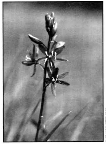
Camassia quamash. Favored root food of Plateau Indians.

virginiana), salal (Gaultheria sp.) and serviceberries (Amelanchier alnifolia). Lichens (Alectoria fremontii) were gathered, particularly from the Mutton Mountains, and pitbaked as a delicacy or "Indian pudding." Acorns were gathered from the Garry Oak (Quercus garryana). Most roots, seeds, and fruits were gathered and eaten in season. Any excess was dried for use throughout the year or saved for times of drought or need.