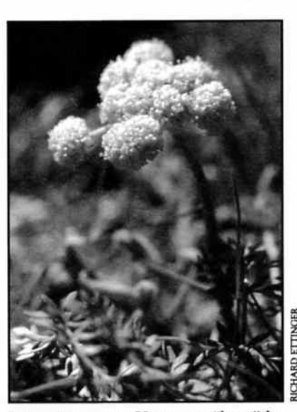
Lomatium cous. Known as "kous" by the Indians, it is one of the first roots to be harvested, and is honored annually at the Root Festival ceremony when thanks is offered for abundant food.

Columbia River and Plateau peoples have used the Reservation lands for millennia, resulting in intensification of plant growth in some cultural plant areas. The most significant cultural plants are used for food, ceremonies, medicines and utilitarian items.