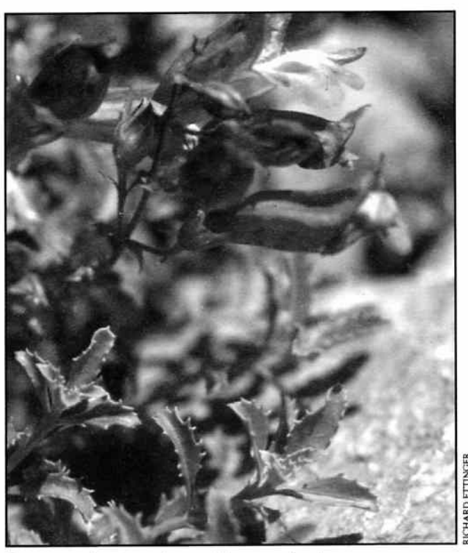
Penstemon fruticosus (potential new variety)

A flourishing population of Penstemon fruticosus with small serrated leaves and large corollas is also of continuing interest. This isolated variety flourishes in an unusual desert rock outcropping near Kah-Nee-Ta resort. It also is undergoing molecular and taxonomic studies at WSU and Ohio State University.