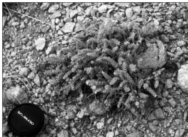
Grimy mousetail ( Ivesia rhypara var. rhypara ) grows over shallow, apricot-colored ash.