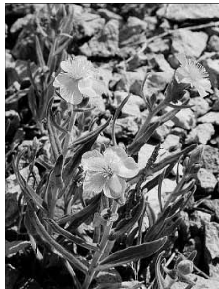
Look for Packard's blazingstar ( Mentzelia packardiae) on greenish-yellow ash-tuff talus slopes.