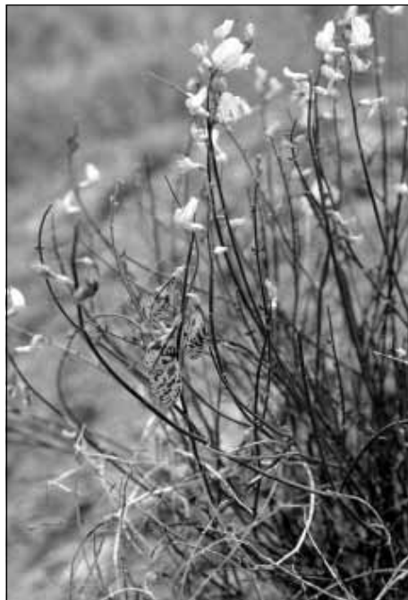
Barren milkvetch ( Astragalus cusickii var. sterilis ), a regional endemic, grows on ash deposits.

The 1995 ACEC Management Plan strives to retain the area's naturalness through careful regulation of human activities. No off-road vehicle use is permitted, and rock-climbing with permanent anchors is prohibited. Use by livestock has been eliminated from the canyon except for seasonal trailing. Camping is authorized at only one site, the primitive campground at Slocum Creek near the reservoir; the rest of the ACEC is designated as day use only. The ACEC is closed to vegetation gathering, rock hounding, and horse use of any kind. The Leslie Gulch ACEC was officially withdrawn from mineral entry in 1999. Noxious weeds ( Cardaria draba and Onopordum acanthium ) have been aggressively treated when found using a variety of control measures, including hand-pulling and spot-spraying.