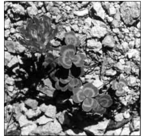
Owyhee clover ( Trifolium owyheense ) is the most spectacular of the rare species.

With heads of fluorescent pink flowers and three leaflets splashed with distinctive white chevrons, Owyhee clover is the most spectacular of the rare species. Barren milkvetch sports inflated pods mottled with red. Close inspection of the diminutive grimy mousetail's inconspicuous pale flowers is necessary to discern its membership in the rose family. To make their debuts, the two annuals, Packard's blazingstar and Ertter's groundsel, depend on timely rainfall, a commodity which has been in short supply the last few years. Of particular note, the groundsel emerges in late summer or fall and has roots protected by a gelatinous sheath, making it particularly adapted to the loose, cobbly tuffaceous ash.