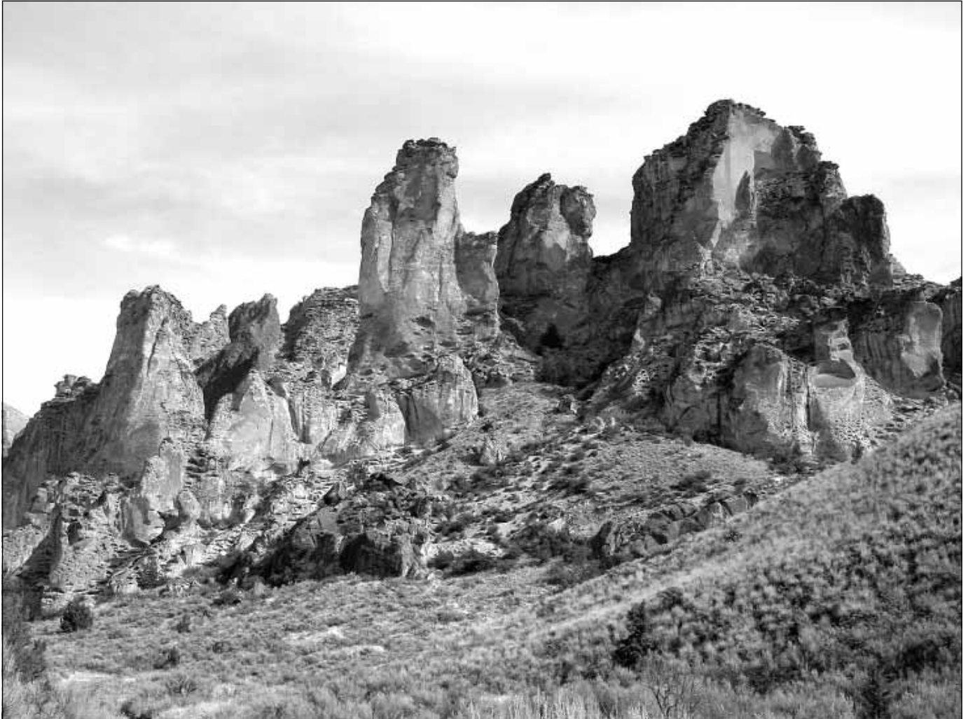
Main canyon of Leslie Gulch.

Vale District BLM, 100 Oregon Street, Vale, OR 97918