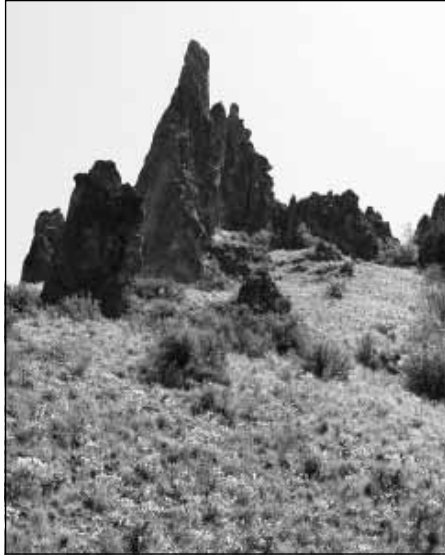
Pinnacles in a side canyon of Leslie Gulch on May 15, 2003.

lie about 70 miles away to the northwest. Among the nearly 100 trees, two individuals are over 200 years old, with the remaining