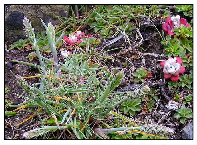
Habit of Poa unilateralis ssp. unilateralis at Crook Point Headland, Curry County, Oregon. Note the upright leaves and compact panicle. Photo by Diane Bilderback on 15 May 2009.

In addition to trampling of fragile sites, humans and other vectors continue to disperse seeds of invasive plant species. Non-native species are now found in virtually every coastal habitat, including