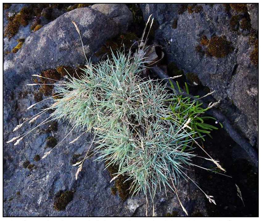
Habit of Poa unilateralis ssp. pachypholis . Note the sprawling habit with horizontal inflorescences and distinctive light bluish-grayish-green foliage.

In 2004, Sayce and Eid found two populations that are now more than 2,000 feet from the ocean due to sand accretion on the north side of the mouth of the Columbia River. These were found on McKenzie Head and Middle Head, between North Head and