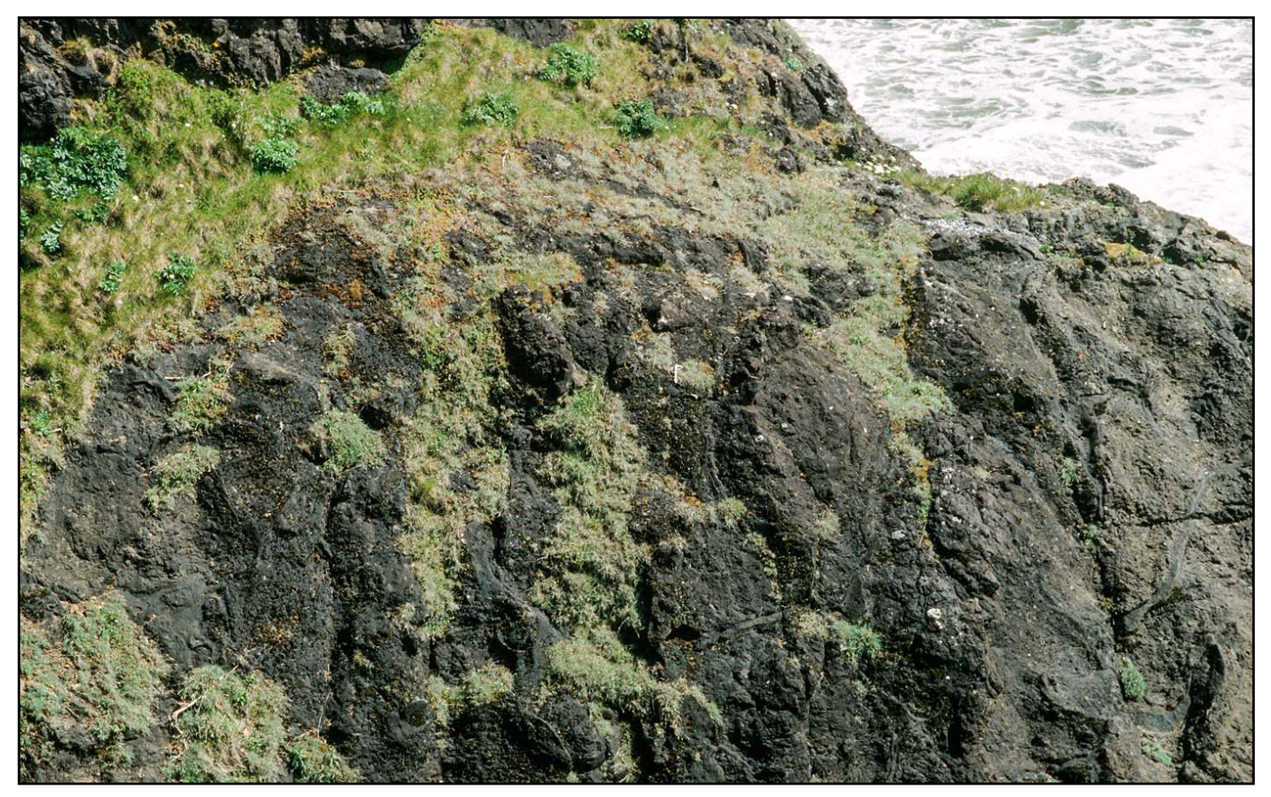
Sea bluff bluegrass (Poa unilateralis) clings to small ledges in basalt cliffs along the coast of Oregon and southern Washington.

While looking at Oregon Flora Project Atlas maps, Roché came upon the names of Dave and Diane Bilderback, botanists in Bandon who have surveyed this species on the south coast for the US Fish and Wildlife Service (Bilderback and Bilderback 2010, 2014). Like Sayce, they had become proficient at surveying with a spotting scope or high powered binoculars, but they also had access