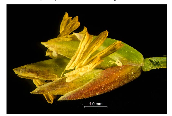
Spikelet of Poa unilateralis ssp. unilateralis from Bandon.