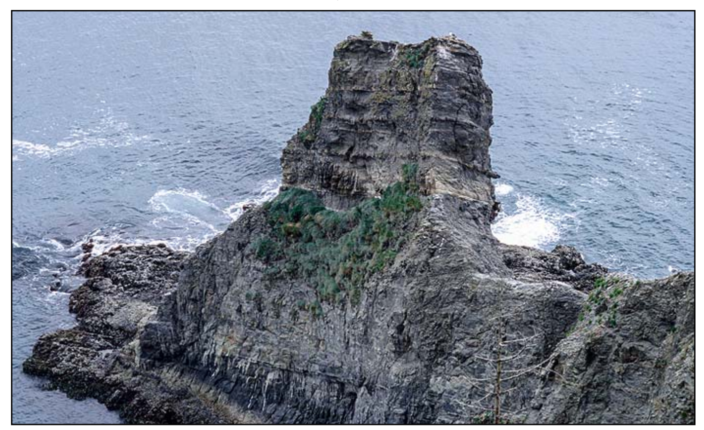
Sea bluff bluegrass grows on the face of Cape Falcon and other stunningly inaccessible habitats along the Pacific Coast.

the offshore islands and seastacks, where weeds may be introduced by waterfowl. Invaders include ice plant ( Carpobrotus chilensis ), velvetgrass ( Holcus lanatus ), wall barley ( Hordeum murinum ), ripgut brome ( Bromus diandrus ), hedgehog dogtailgrass ( Cynosurus echinatus ), and various bentgrasses ( Agrostis spp.). Trailplant ( Soliva sessilis ), a recent Patagonian arrival at Cape Disappointment (Wise and Kagan 2012), has made its way north and south along the coasts of Oregon and Washington. Normally found on hard-packed trails, it has been carried out onto sea cliffs by birds, fishermen and other visitors and seems at home there as well. Probably the most severe threat is from introduced clonal grasses, which displace Poa unilateralis from ledges of sea cliffs.