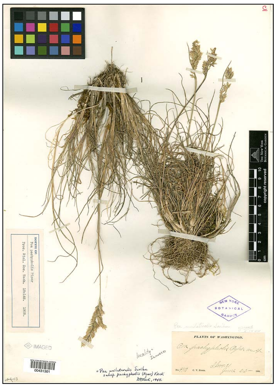
Isotype of Poa pachypholis collected by CV Piper June 22, 1904, from Ilwaco, Pacific County, Washington.

South of the Columbia River, if a rock is high enough above the ocean to have a meadow on top of it, sea bluff bluegrass probably grows on it: on both ends of Tillamook Head, Haystack Rock in Cannon Beach, and south to Neahkahnie Mountain. On sea cliffs, it is found only below the Festuca-Sedum meadows. Lichens, mosses and the occasional mist maiden ( Romanzoffia traceyi ) or monkey flower ( Mimulus guttatus ) are its main companions. On the north coast of Oregon and south coast of Washington, populations are consistently located on north to northeast-facing cliffs, or on west-