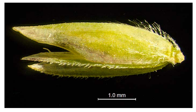
Floret of Poa unilateralis ssp. unilateralis from Bandon. Note the villous pubescence along the lemma and marginal veins in the lower third of the lemma.