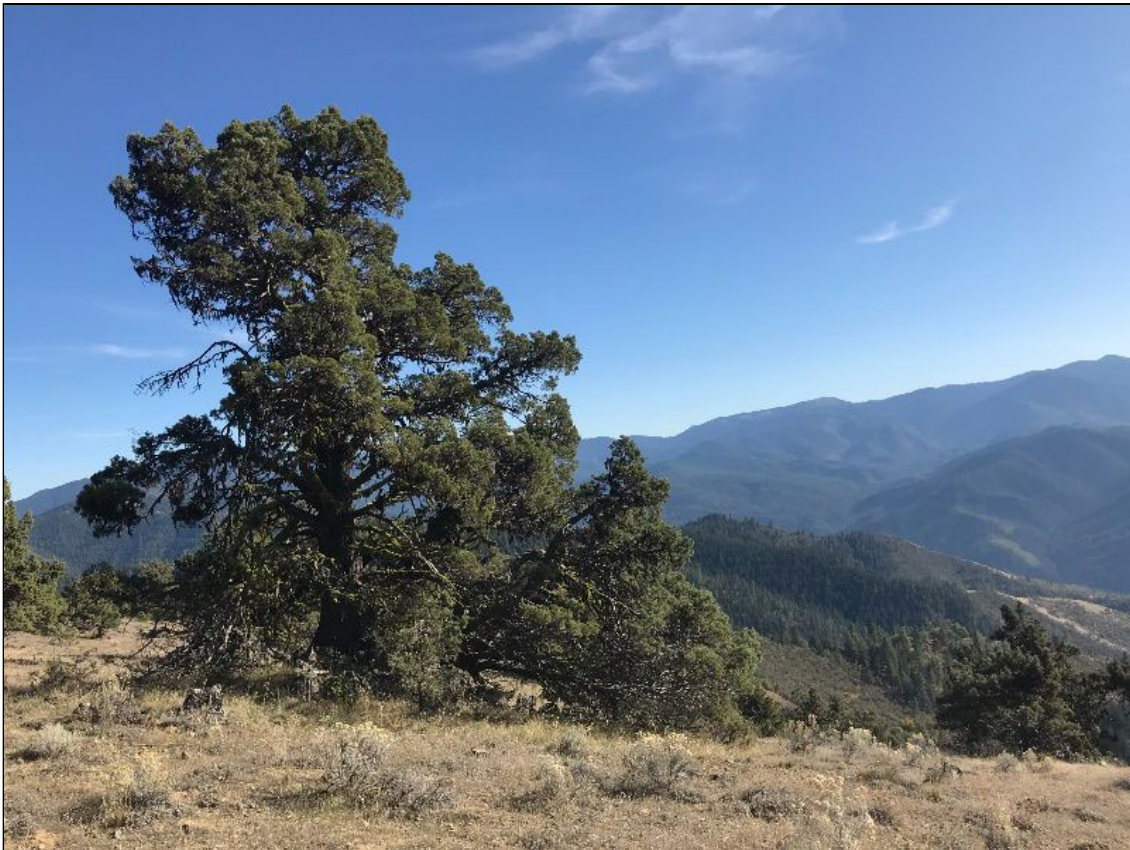
A mature western juniper on the southern face of Anderson Butte in the Little Applegate River watershed.

In the October 2023 NPSO Bulletin , Applegate Siskiyou Alliance announced the release of the first publication in our Siskiyou Crest White Paper Series, a project of the Siskiyou Ecological Research Project . The Siskiyou Crest White Paper Series utilizes citizen science to document the region's incredible biodiversity. We work to fill in the gaps in the academic literature and build a stronger sense of place and appreciation for the West