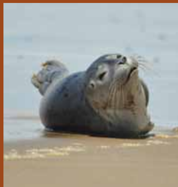
Baby Harbor Seal