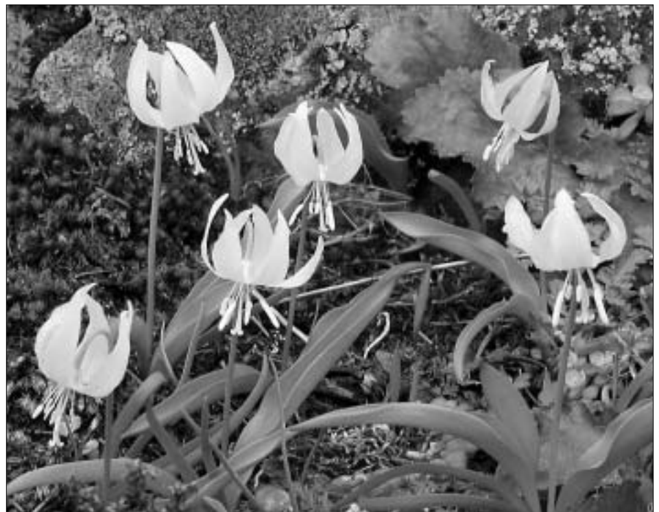
The bright yellow flowers of Glacier Lilies (Erythronium grandiflorum) are one of the earliest signs of spring. Where they bloom in the mountains, you often have to cross melting snow to see them as I did to photograph these on Patterson Mountain in Lane County where they were blooming at 4400' in mid-May.