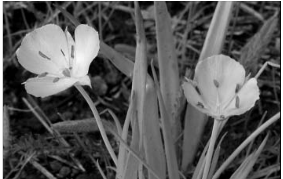
Calichortus uniflorus is a lovely small pink mariposa lily of the Siskiyou area.

For information on the North Coast Chapter, contact Janet Stahl at 503-842-8708 or jjs@oregoncoast.com .