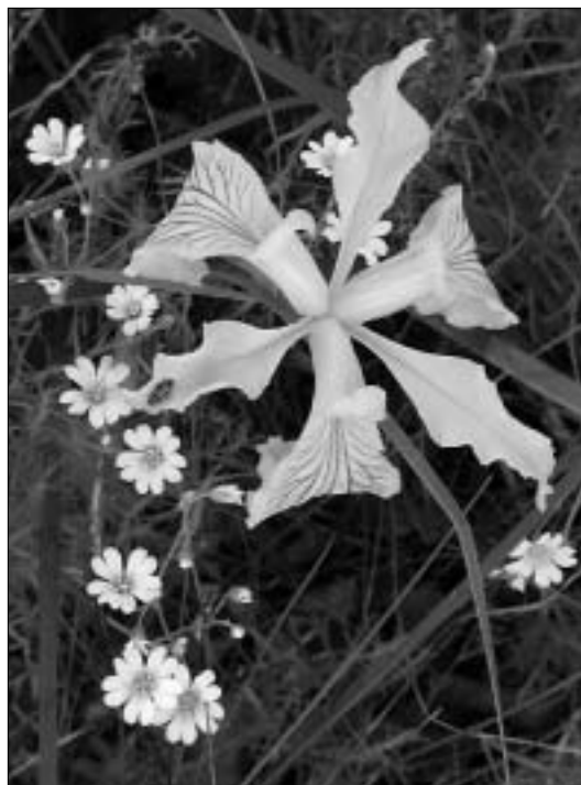
Iris bracteata and Cerastium arvense at Rough and Ready Botanical Wayside near O'Brien.