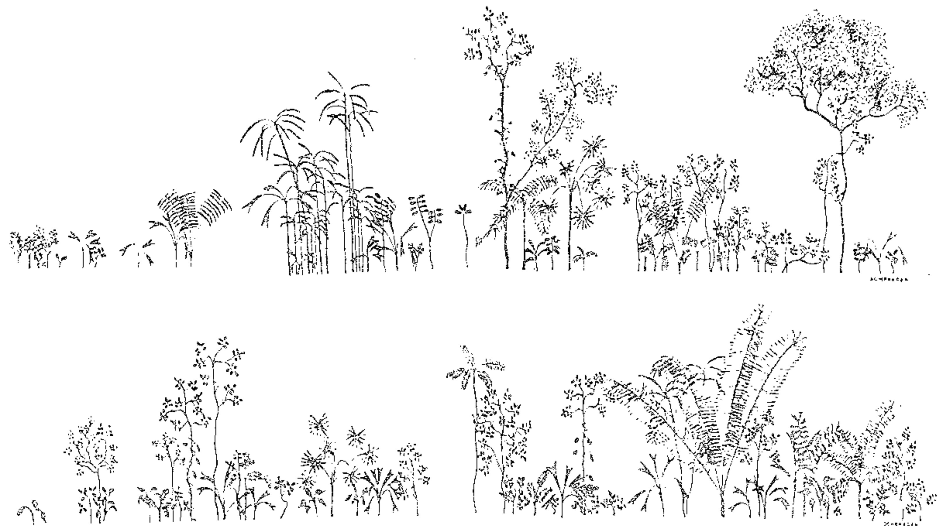
Profile of Premontane Wet Forest at Sarapiquí