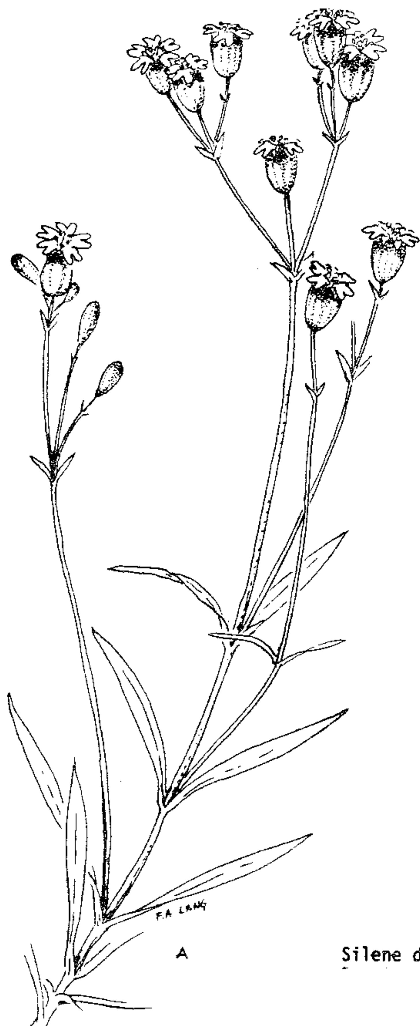
A Silene douglasii var. oraria .