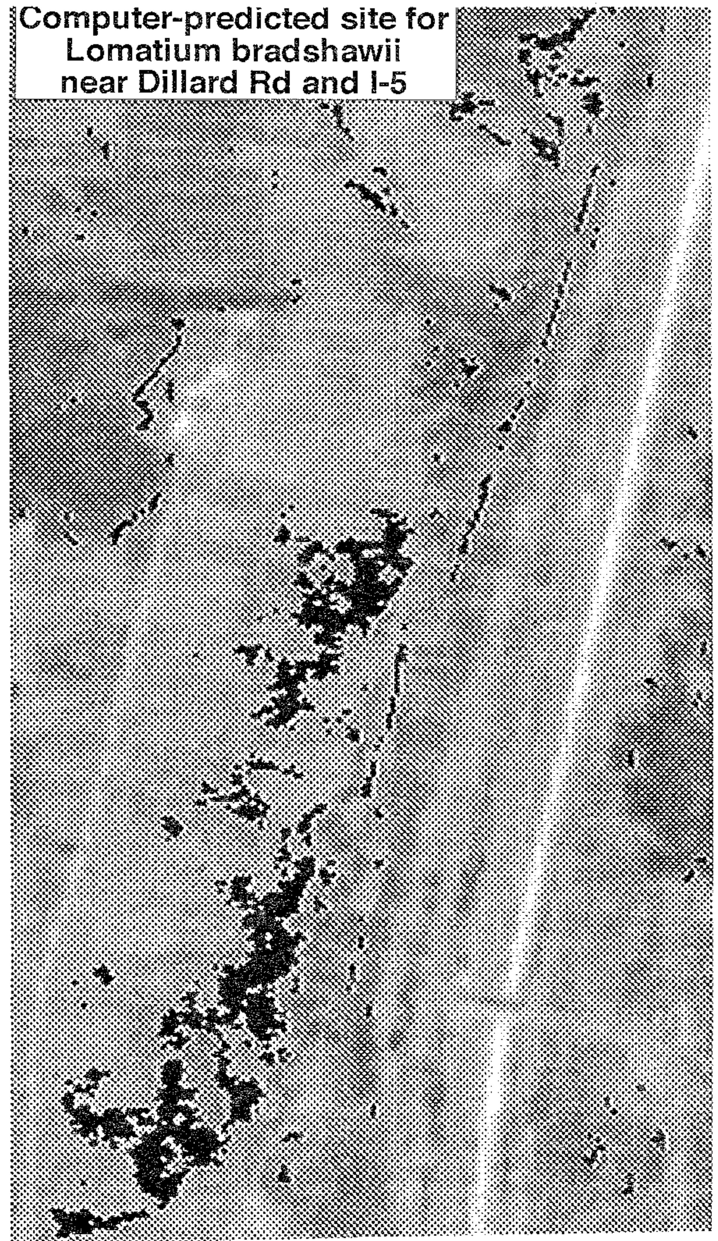
Computer-predicted site for Lomatium bradshawii near Dillard Rd and I-5