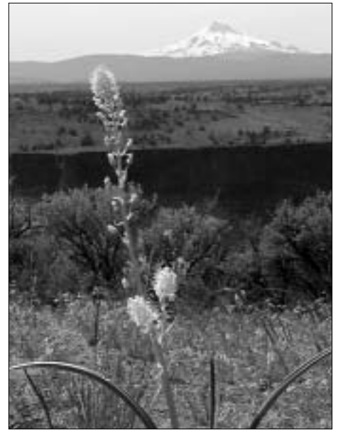
Mt. Jefferson creates a picturesque backdrop for Death-camas, Zigadenus venenosus .

Note: I haven't had time to identify all the plants. If you can ID any of these photos or know where I could get a relevant plant list I would really appreciate it!