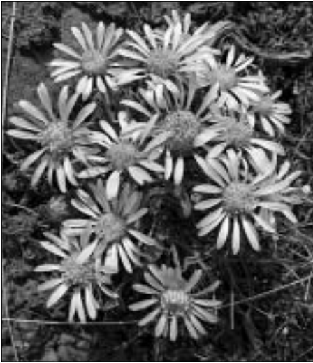
Cushion fleabane, Erigeron poliospermus at Cove Palisades State Park. See page 70 for more pictures from the park.