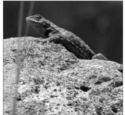
Left to right: A butterfly enjoys nectar from one of three beautiful, dwarf species of Erigeron ; Phlox in all shades from white to magenta was at the tail end of a splendid bloom; A lizard suns himself on a rock. Many birds were about as well.