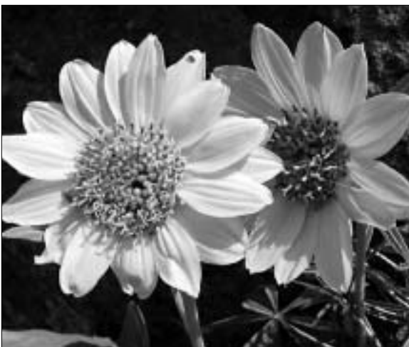
Above: The canyon slopes were covered with balsamroot as well as lupine and astragalus.