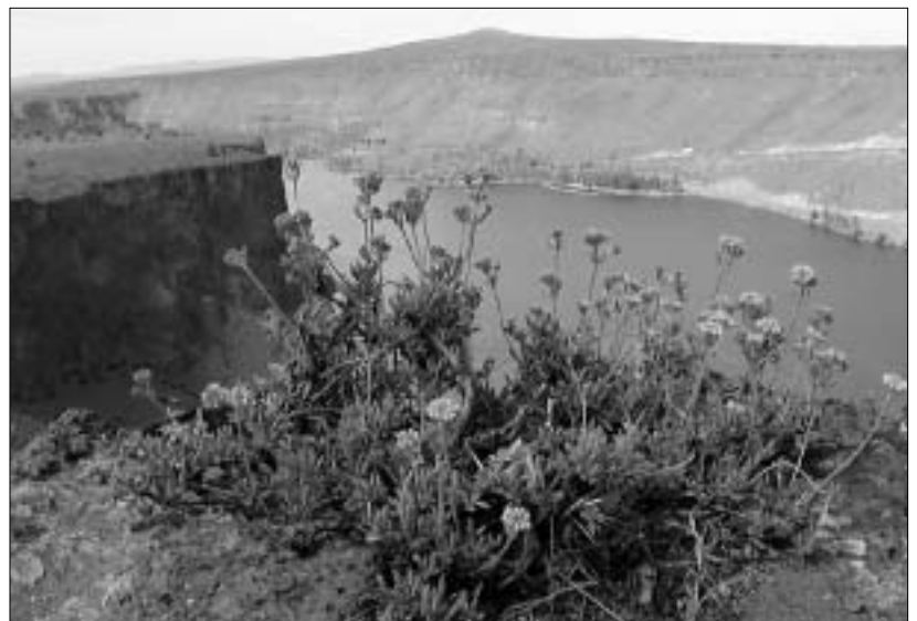
Right: Several kinds of eriogonums were starting to bloom on the gravelly flats of the plateau.