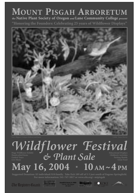
ARTWORK BY TANYA HARVEY

Join Mt. Hood National Forest botanist, Carol Horvath, to view a colorful array of spring wildflowers as you slowly hike about 1 mile of the Salmon River Trail #742. Learn the common plants, trees, wildlife, and fish of the area. Meet at the Zigzag Ranger District at 70220 E. Hwy 26 at 10 am, then carpool 7 miles to the trailhead. A Northwest Forest Pass is required to park and may be purchased at the Ranger District office. Bring water, lunch, rain gear, warm clothing, and supportive shoes or boots for walking on the uneven terrain of a forest trail.