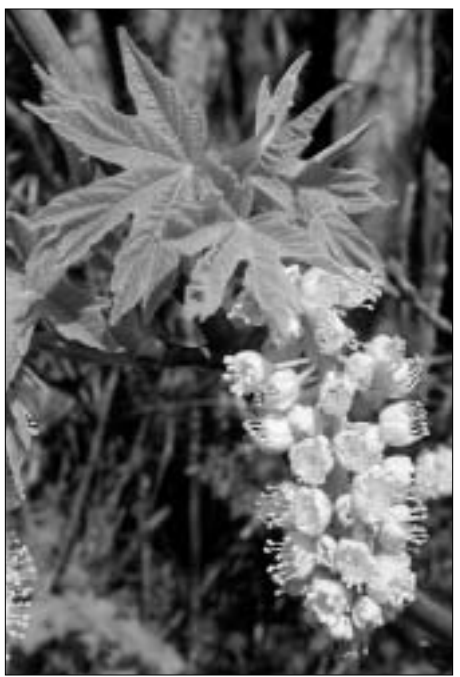
Bigleaf maples (Acer macrophyllum) open their large pendulous racemes of yellow-green flowers in March in the lowlands.

For information on the William Cusick Chapter call Frazier Nichol at 541-963-7870.