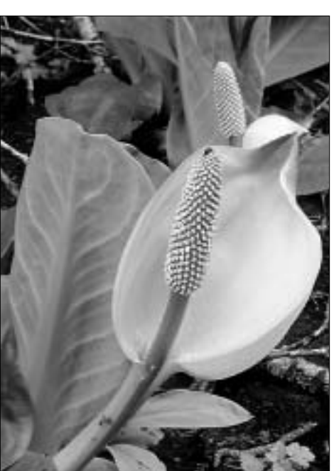
Another sign of spring is the bright yellow spathe of skunk cabbage (Lysichiton americanus). Its real flowers are tiny and grow in precise patterned rows on the spadix.