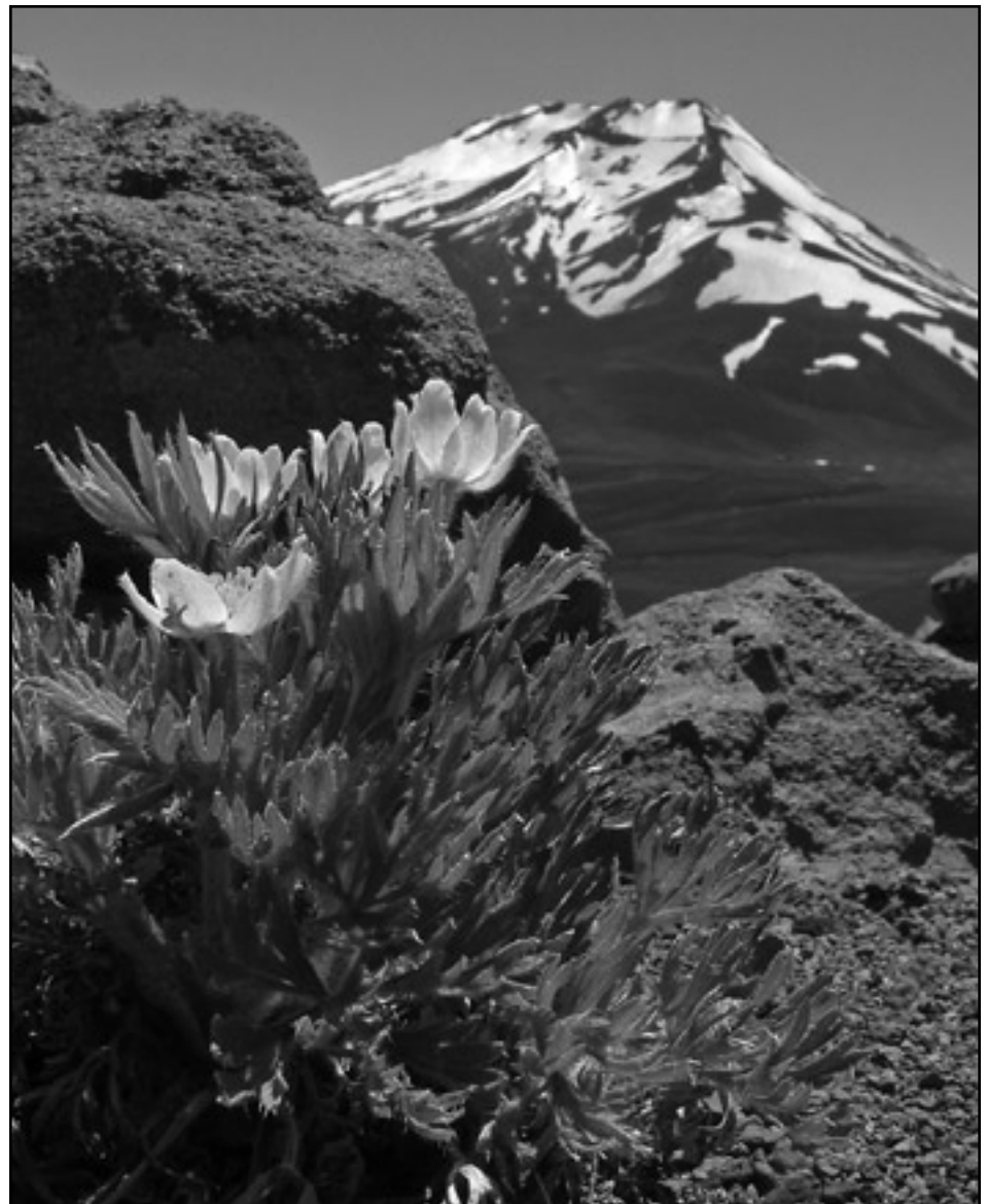
Look familiar? This is Anemone multifida growing in volcanic cinder... in southern Chile! Volcan Lonquimay can be seen in the background in mid-December. Other genera and species of plants native to Oregon can also be found over 6500 miles away in South America.