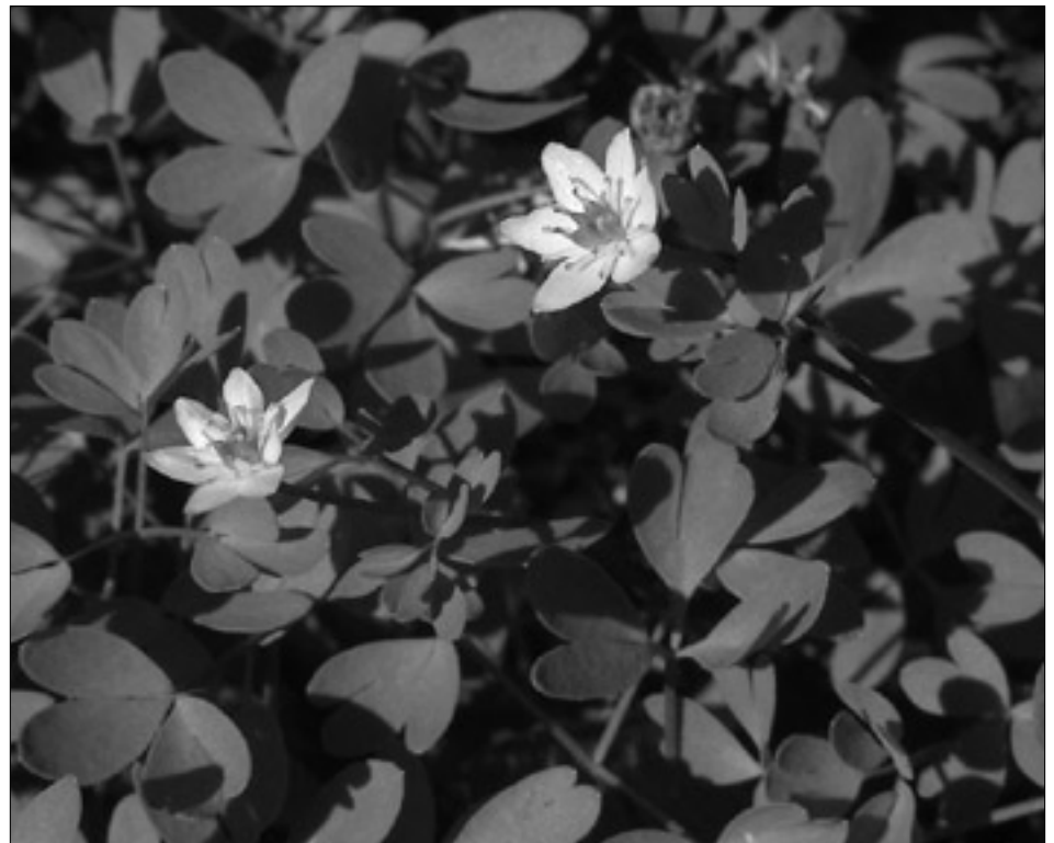
Dwarf isopyrum or false meadowrue (Enemion stipitatum) is an early bloomer in the buttercup family. Join the Emerald Chapter for a trip to see this rare plant at Mount Pisgah near Eugene.

Field Trip: Catherine Creek. The premiere early flower spot in the Gorge, with Olsynium douglasii in profusion, Fritillaria pudica , Lithophragma glabra , several Lomatiums , and many others.