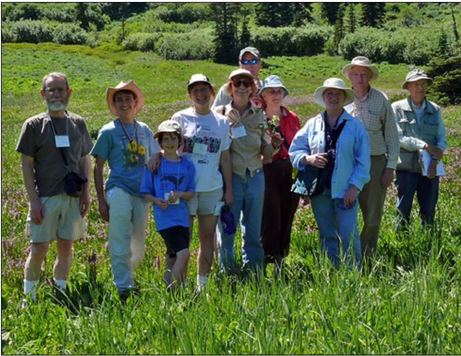
At the end of a fun day of botanizing, field trip participants gather in front of large sweeps of tall mountain shooting star (Dodecatheon jeffreyi) in the wet meadows of Groundhog Mountain.