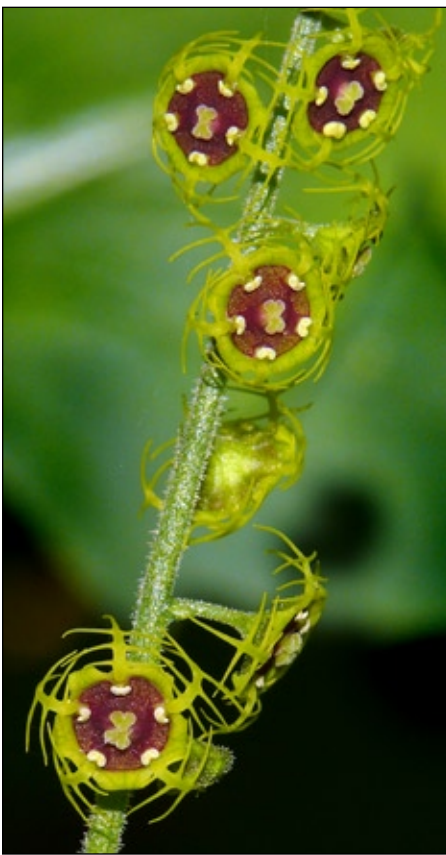
The tiny flowers of the alpine mitrewort (Mitella pentandra) require a hand lens to appreciate their unusual shape. Several species of mitreworts were seen by participants.