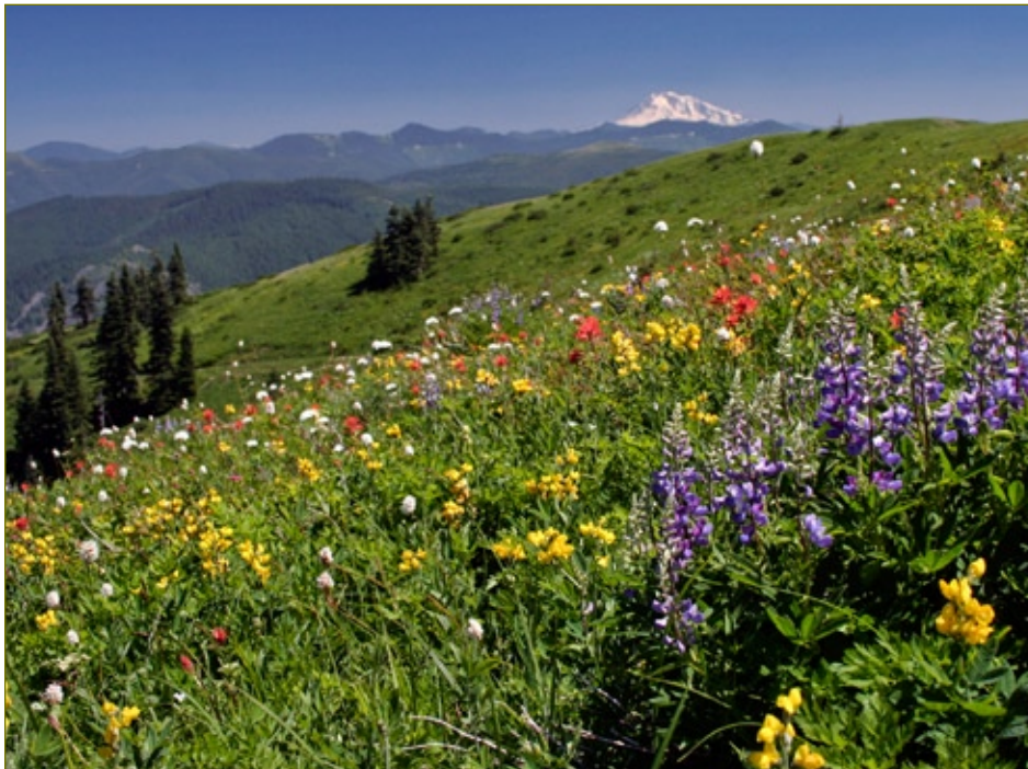
View NE towards Mt. Adams as seen from Silverstar Mountain on the Portland Chapter's July 19th field trip. Plants in foreground include American Bistort ( Bistorta bistortoides ), Common Paintbrush ( Castilleja miniata ), Broadleaf Lupine ( Lupinus latifolius latifolius ), and Golden-pea ( Thermopsis montana ovata ).