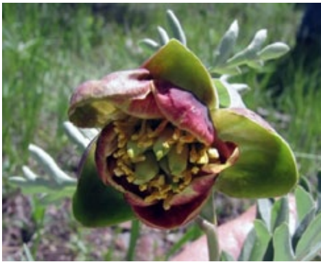
Western peony, Paeonia brownii , in bloom

Fritillaria atropurpurea , and the floral highlights just got better as we hiked up through open forest and rocky meadows. In the forest our native peony, Paeonia brownii , was in bloom and morel mushrooms, Morchella deliciosa , were at their prime. A cliff face covered with colorful lichens was topped with beautiful gnarled mountain mahogany, Cercocarpus ledifolius var. ledifolius , at the base of the cliff were numerous bunches of creamy-yellow clustered broomrape, Orobancha fasciculata . As we climbed higher the forest gave way to rocky meadows dotted with blues of stickseed, Hackelia micrantha , spurred lupine, Lupinus arbustus , and larkspur, Delphinium nuttallianum , reds and yellows of paintbrush, Castilleja applegatei v. pinetorum and balsamroot, Balsamorhiza sagittata ,