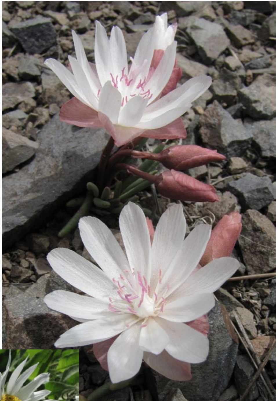
Bitterroot, Lewisia rediviva with rose-color flower buds and pink bloom!"

Fritillaria atropurpurea , and the floral highlights just got better as we hiked up through open forest and rocky meadows. In the forest our native peony, Paeonia brownii , was in bloom and morel mushrooms, Morchella deliciosa , were at their prime. A cliff face covered with colorful lichens was topped with beautiful gnarled mountain mahogany, Cercocarpus ledifolius var. ledifolius , at the base of the cliff were numerous bunches of creamy-yellow clustered broomrape, Orobancha fasciculata . As we climbed higher the forest gave way to rocky meadows dotted with blues of stickseed, Hackelia micrantha , spurred lupine, Lupinus arbustus , and larkspur, Delphinium nuttallianum , reds and yellows of paintbrush, Castilleja applegatei v. pinetorum and balsamroot, Balsamorhiza sagittata ,