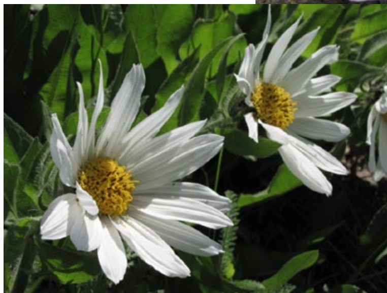
White headed wyethia, Wyethia helianthoides

all among the dusty-green sages of Artemisia arbuscula , A. rigida and A. tridentata . Finally at the top and spread before us were scenic views and an open bald with the largest population of Bitterroot, Lewisia rediviva , I have ever seen all in swollen rose-color flower buds and pink bloom!