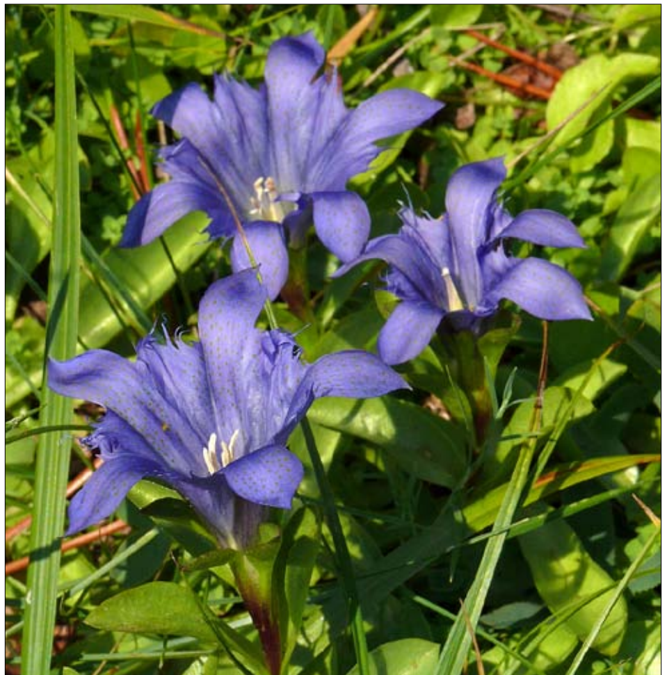
Late season gems: Newberry's gentian ( Gentiana newberryi ) blooming in September. This rare species is found in Oregon only in a few places in the High Cascades.

Before you renew, please take a quick look at the address label on your Bulletin . If 2012 or a later year appears along top edge of the label (or if it's blank), you do NOT need to renew—your membership is good through the end of next year. Don't forget that year-end is a good time to consider making a tax-deductible contribution to one of our special funds. The Leighton Ho Memorial Award is used for research projects in Western Oregon. The Rare and Endangered Plant Fund supports work with our most threatened plants. The Augusta Rockefeller and Jean Davis memorial scholarships are awarded annually to botany students at an Oregon college or university. You may also include a contribution to the Oregon Flora Project along with your dues.