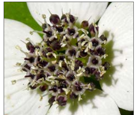
True flowers of Bunchberry (Cornus unalaschensis)

Visit our Web site at http://williamcusick.npsoregon.org or contact Laurie Allen at 541-805-0499 for updates and general information.