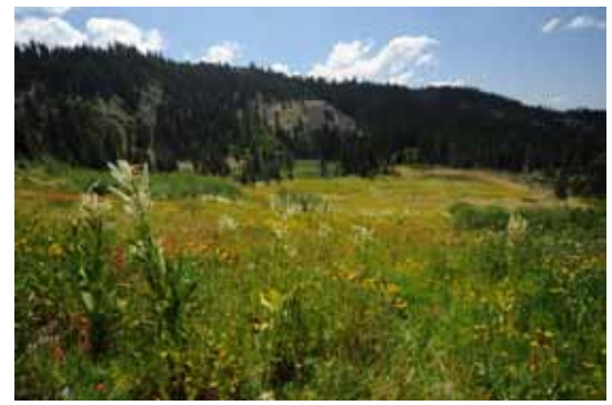
Bigelow Lake, Mt. Elijah area

Our headquarters for the meeting will be the Deer Creek Center, which lies along Deer Creek at the base of Eight Dollar Mountain and serves as the gateway to the Wild and Scenic Illinois River. Co-owned by Southern Oregon University and Siskiyou Field Institute, the Center provides natural history education for youth and adults and supports research in the Klamath-Siskiyou Bioregion. Exploration of the region can begin right outside the door at the 850-acre Deer Creek Center, including riparian zones along Deer Creek and the Illinois River,