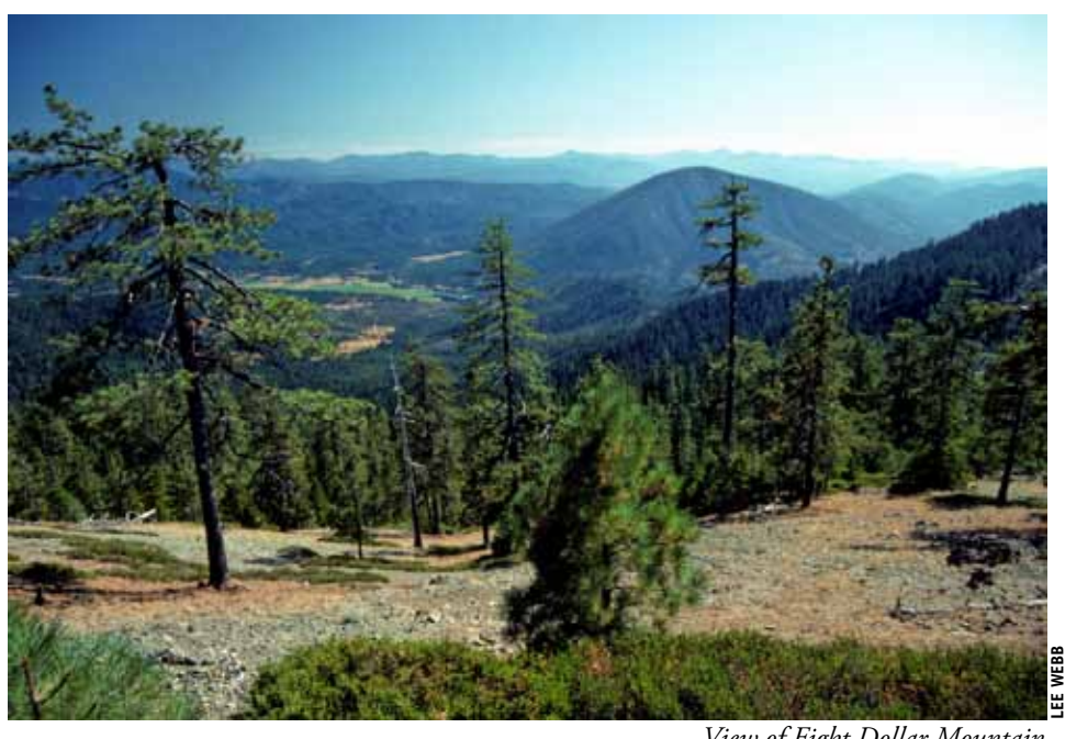
View of Eight Dollar Mountain

Hike Onion Camp to Whetstone Butte. Moderate. Leaders: Lee Webb (Wildlife Biologist) and Karen Mc-Cullough (Botanist). Stop at Eight Dollar Mtn. Darlingtonia boardwalk, continue 14 miles on Rd 4201 to top of ridge – most of the trip within the 2002 Biscuit Fire area. Stop to see Lupinus tracyi and Picea breweriana; then to Onion Camp trailhead, and hike on trail 2.5 miles roundtrip to Whetstone Butte, on the edge of the Kalmiopsis Wilderness. Great serpentine vistas. Lilium bolanderi, Xerophyllum tenax, Quercus sadleriana and Pinus jeffreyi. 45 miles RT.