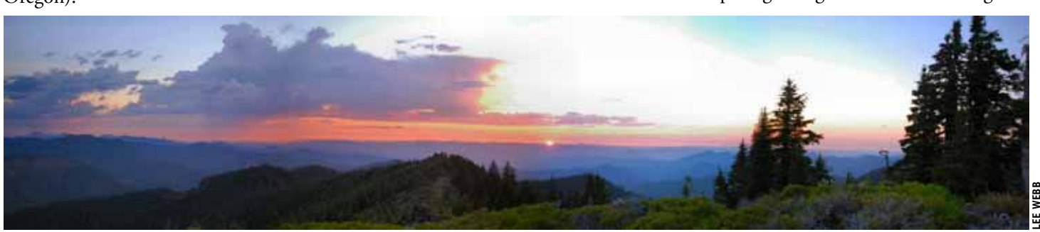
Mt. Elijah panorama

The Annual Meeting is for members only. New members are always welcome to join; use the membership form in the back of the Bulletin . Students interested in a scholarship should e-mail us at annualmeeting12@siskiyou.npsoregon.org. For more information and updates about the meeting, please visit our website: http://siskiyou.npsoregon.org/2012annualmeeting/.