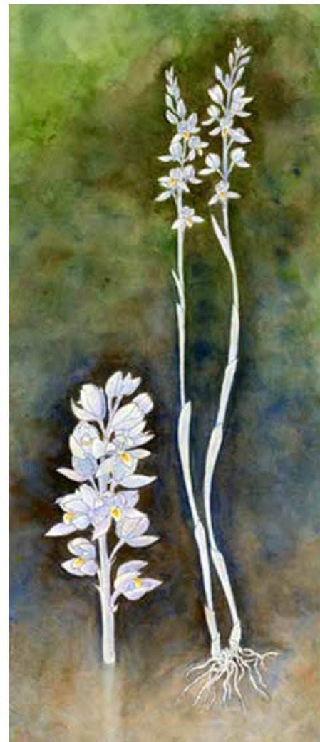
Cephalanthera austinae, Phantom Orchid, Giclee print of ink and watercolor