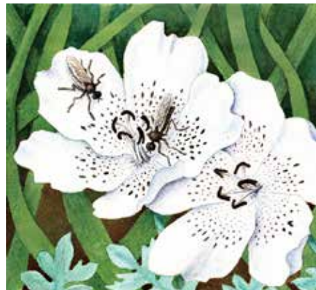
Salt and Pepper #1 (Nemophila menziesii var. atomaria); this watercolor will grace the 2013 Mt Pisgah Arboretum Wildflower Festival Poster.