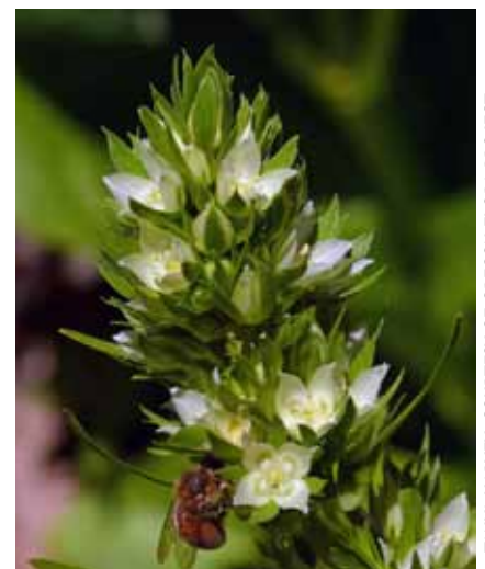
Frasiera umpquaensis may be in bloom on the June 29 and July 19 field trips in Lane County.

Do you have fond memories of this year's Annual Meeting in and around Cannon Beach? Perhaps you saw intriguing species on a field trip, caught up with old friends, or volunteered to help the event run smoothly. Whether your memories are in text, photos, or illustrations, we invite you to share them in the Bulletin . NPSO armchair travelers are waiting for you to submit your articles and/or high resolution images to bulletin@NPSOregon.org . The submission deadline for the August/September Bulletin is July 24.