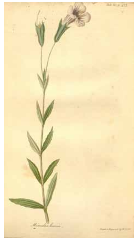
Mimulus lewisii . Drawn and engraved by W. Hooker, for Flora Americae Septentrionalis by Pursh.