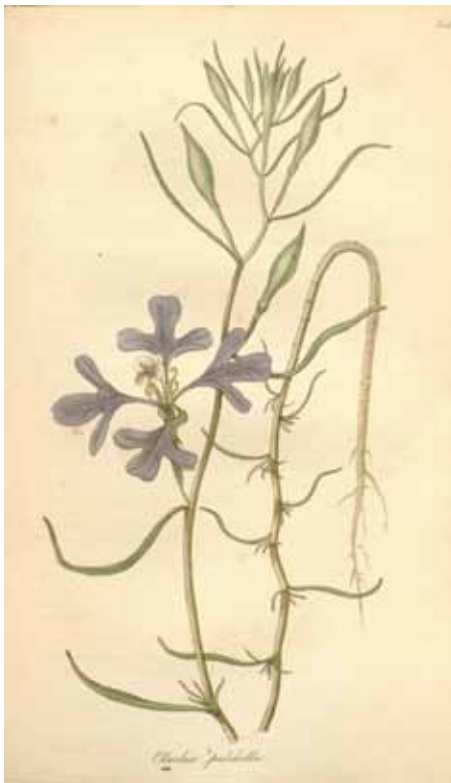
Clarkia pulchella , classified and named by Frederick Pursh. Illustration from Flora Americae Septentrionalis by Pursh.

Much later, other botanists glued the specimens to high-rag content