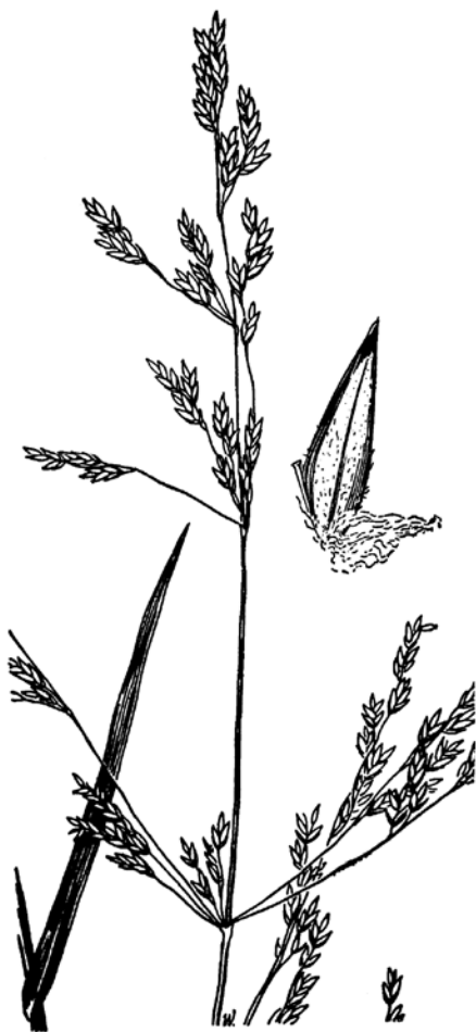
USDA-NRCS PLANTS DATABASE