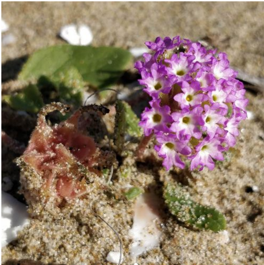
Pink sand verbena ( Abronia umbellata ) near Coos Bay.