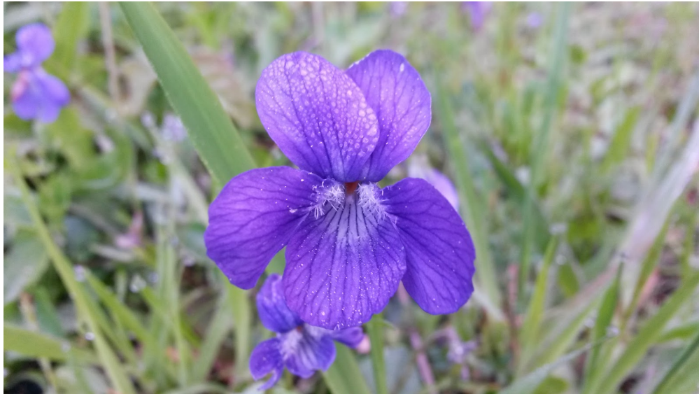
Early blue violet ( Viola adunca ) at Nestucca Bay NWR.

A large population of this species of violet is essential throughout the butterflies' life cycle, thus it is necessary to provide quality habitat to support both species. Eggs are oviposited near the violets in early fall, with adults preferring moderate sun exposure. After about 16 days, the larvae hatch and find a place to overwinter nearby. In the spring, the larvae feed on the violet leaves as they grow and molt before they pupate. From July to September, the adults emerge from their pupal case, travel to nearby forests, and begin their mating season. Habitat destruction by human development, grazing, and fire suppression followed by succession of woody plants are the main threats to the butterfly's survival. In order to support this species, the USFWS has been working with multiple partners to manage existing habitat and to reestablish habitat conducive to the needs of the Oregon silverspot butterfly and Viola adunca .