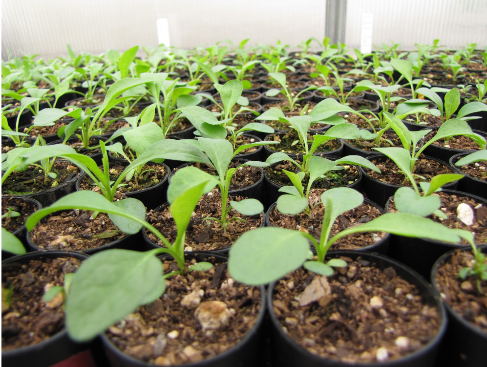
Propagation of pacific aster ( Symphyotrichum chilense ) for restoration at Nestucca Bay NWR.

where it must compete with introduced forb and graminoid species which grow aggressively in disturbed soils. Since violets are low-growing, mowing is recommended to prevent shading by introduced graminoids. In addition to control of non-native species, early blue violet plugs were planted to support the Oregon silverspot butterfly throughout its life cycle. To increase the availability of seed for restoration, wild seed collection and propagation are a key part of this effort.