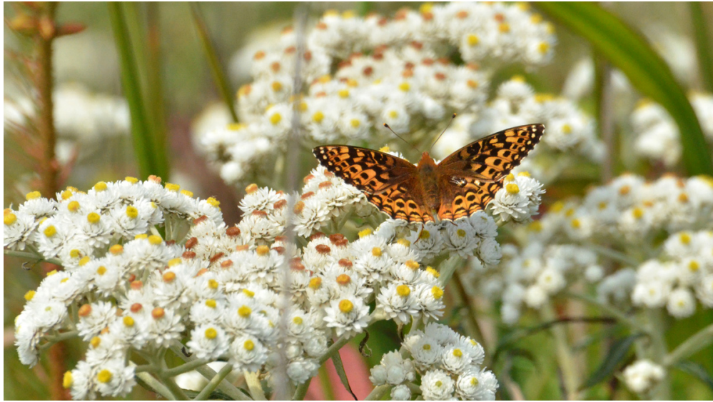
Oregon silverspot butterfly ( Speyeria zerene hippolyta ) nectaring on pearly everlasting ( Anaphalis margaritacea ) at Nestucca Bay NWR.

Nestucca Bay NWR was created in 1991 for the purpose of protecting and restoring habitat for Dusky Canada Geese and Aleutian Cackling Geese, but has since provided refuge for more than migrating birds. Since the refuge was established--with help from The Nature Conservancy--the USFWS Coastal Program has acquired parcels of land that put the total acreage at 1,202 acres, making it the largest refuge within the Oregon Coastal Refuge Complex. Prior to its designation the area had been largely used for cattle grazing by dairy operations, which led to the introduction of invasive grasses and the loss of native plants and coastal prairie habitat. Due to the fact that only one percent of Oregon's coastal prairie remains intact--which in turn affects the reproductive efforts of the Oregon silverspot butterfly--there is a collaborative effort at Nestucca Bay NWR to restore the habitat to its previous diversity and functionality.