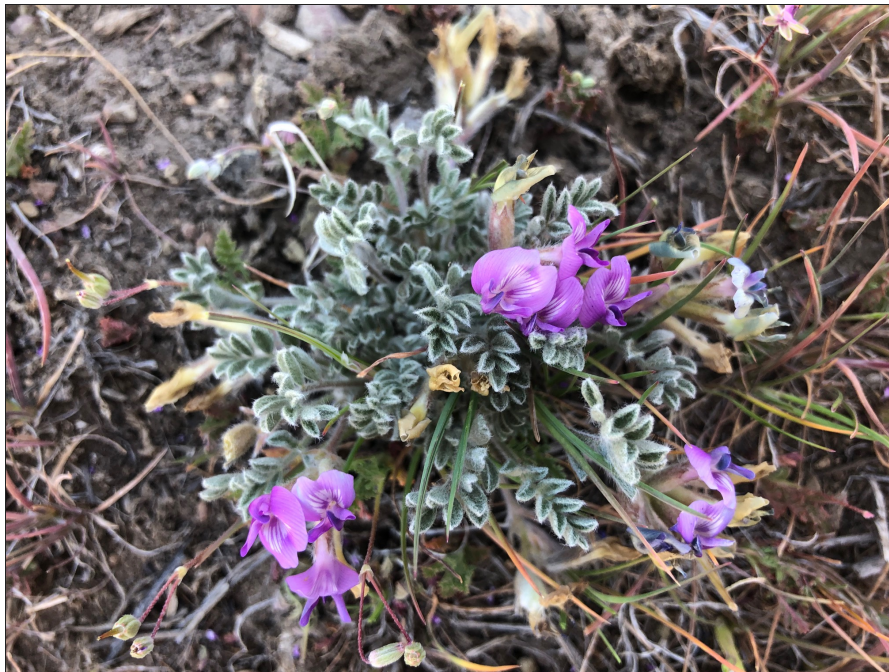
Photo of Astragalus purshii