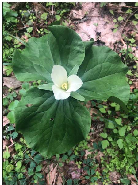
Erythronium hendersonii (left) and Trillium albidum (right)