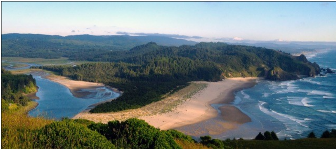
UNESCO Cascade Head Biosphere Reserve: site of five field trips

Field trips will visit Willamette Valley oak savannas and prairies, coastal forests, beaches, and estuaries. Featured will be efforts by groups, including the Confederated Tribes of Grand Ronde (CTGR), the Nature Conservancy, Sitka Center for Art & Ecology, Institute for Applied Ecology, Yamhill Soil & Water District, U.S. Forest Service, and U.S. Fish & Wildlife Service, all of which are actively involved in restoring native habitats.