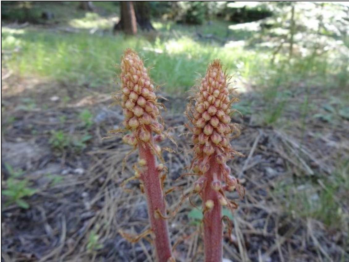
Pinedrops, Pterospora andromedea , in the Ochoco Mountains, 2015.