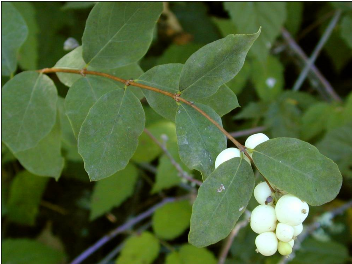
Common snowberry (Symphoricarpos albus)

December 2021/January 2022 Volume 54, No. 10