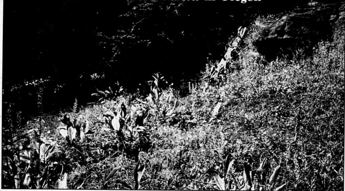
A. gormanii field study site no. 3 looking southwest