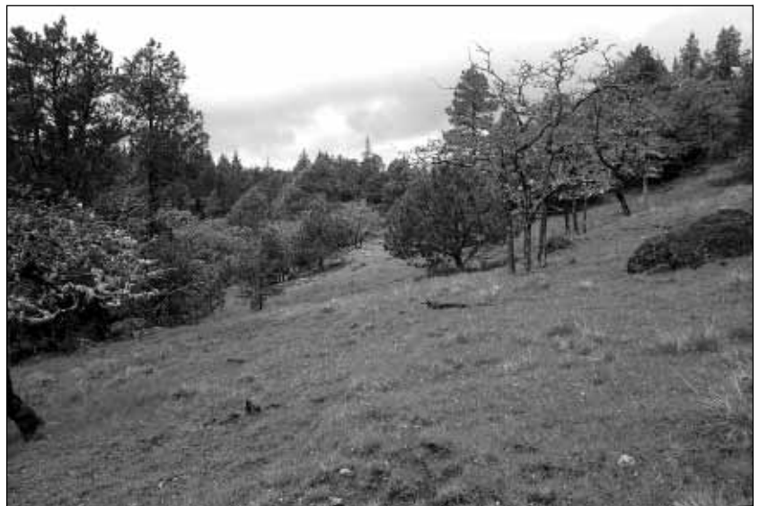
The Oregon white oak savanna of North Fork Hunter Creek is unusual in its proximity to the Pacific Ocean.

The streams entering Hunter Creek and Hunter Spring Bogs drain over rock that contains unusually high concentrations of magnesium and iron. This rock type is sometimes referred to as ultramafic rock, from ultra meaning high, and mafic (meaning composed of magnesium [magnesium] and iron [Latin ferrum ] + ic ) (Kruckeberg