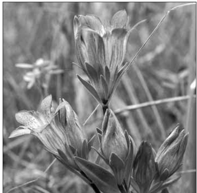
Mendocino gentian growing in Hunter Creek Bog.

Other rare or uncommon plants to look for at Hunter Creek ACECs are Vollmer’s lily ( Lilium pardalinum ssp. vollmeri ), serpentine phacelia ( Phacelia corymbosa ), Howell’s bicuitroot ( Lomatium howellii ), roundleaf sundew, fringed pinesap