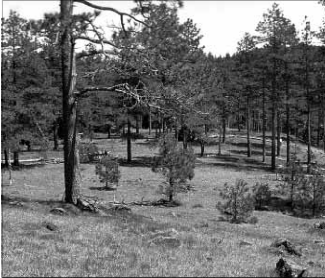
An open Jeffrey pine woodland with an understory of Piper's bluegrass ( Poa piperi ) on the upper slopes of North Fork Hunter Creek.

1984a, Brooks 1987). The ultramafic parent materials are serpentinite and its parent rock, peridotite. Serpentinite formed at the subduction zone of the continental plate when water released from the seafloor combined with the mantle rock (Bishop 2003). Serpentinite has a shiny green surface, polished under the pressure of slow, constant movement of continental plates. High in magnesium, but destitute of plant-sustaining elements such as potassium and sodium, serpentinite and peridotite zones support only meager vegetative cover.