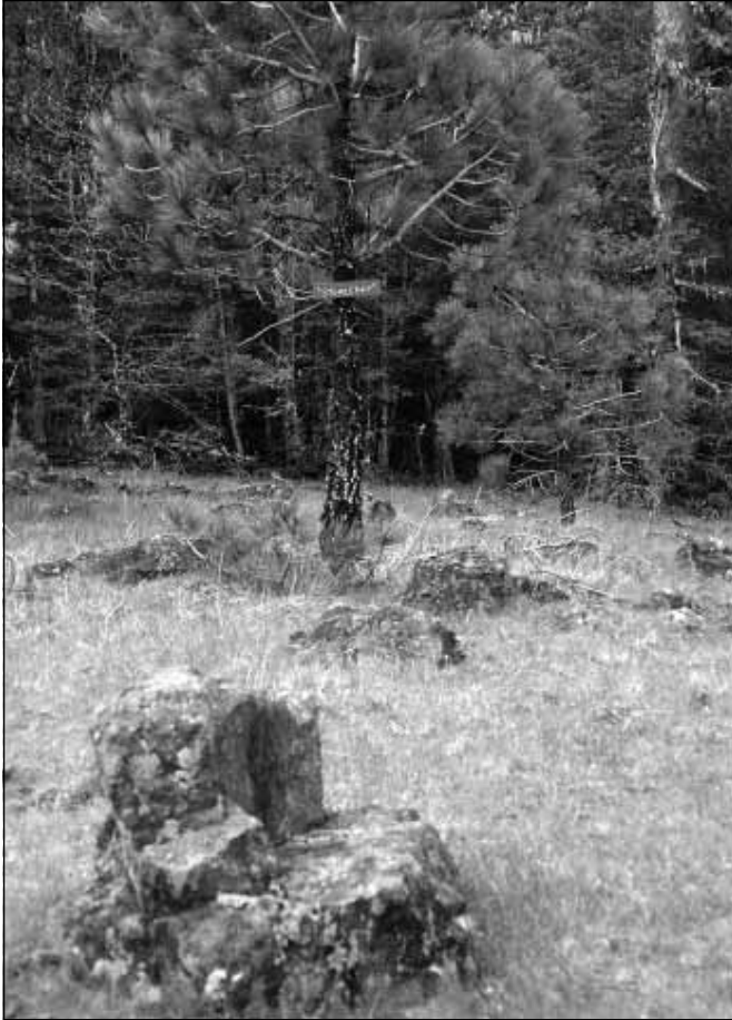
Lichen-covered rocks in the shape of a chair, for which the Stone Chair trail is named, sit in a California oatgrass opening among Jeffrey pine.

Stone Chair trailhead is located just past the Hunter Creek Bog, but it is difficult to find as it is unmarked. Easier access and the advantage of walking downhill from the highest point are gained via the northern terminus of the Stone Chair trail. The trail is named for rocks grouped in the shape of a chair. The unmarked trailhead is located off of USFS Road 195, approximately 6.4 miles past Hunter Creek Bog. The trail winds through the open Jeffrey pine forest. Hikers are eventually rewarded with distant views of the Pacific Ocean. Visitor etiquette calls for taking nothing but pictures and leaving nothing but footprints. Off-road vehicles are not permitted.