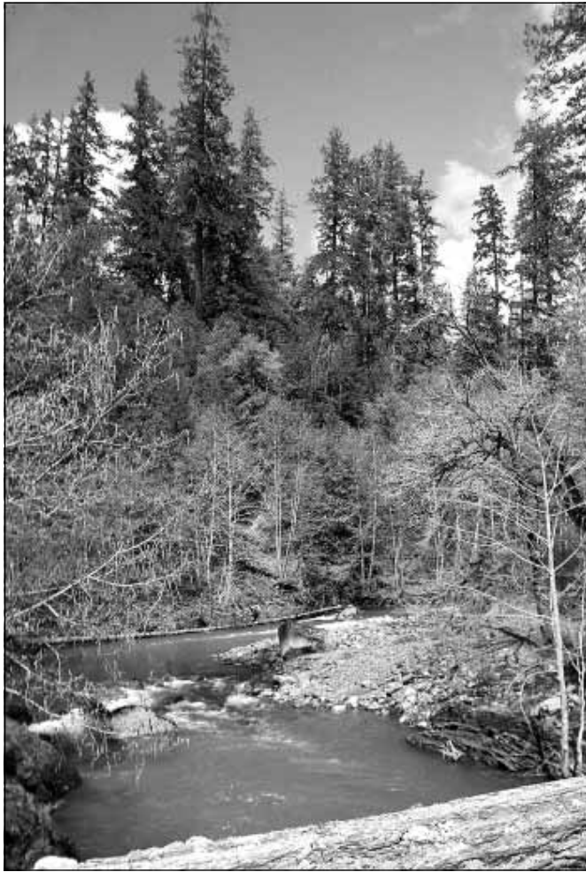
Riparian woodland of Port Orford cedar, Douglas fir, red alder, bigleaf maple, California laurel, and tanoak along the North Fork of Hunter Creek.

( Pleurospora fimbriolata ), evergreen everlasting ( Antennaria suffrutescens ), brook wakerobin ( Trillium rivale ), fairy slipper ( Calypso bulbosa ), silky horkelia ( Horkelia sericata ), golden iris ( Iris innominata ), giant chainfern ( Woodwardia fimbriata ), Oregon fawnlily ( Erythronium oregonum ), Del Norte pea ( Lathyrus delnorticus ), and Scouler's woollyweed ( Hieracium scouleri ).