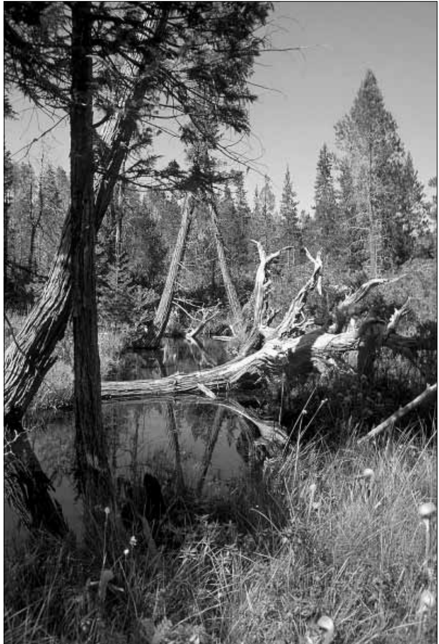
Jeffrey pine and Port Orford cedar surround a watery jungle of California pitcherplant in Hunter Creek Bog.

The Hunter Creek ACECs were designated for four natural resource values: 1) special status species, 2) natural systems and plant community, 3) fish and wildlife habitat, and 4) historic and cultural resources. Twelve special status plant species (see list at