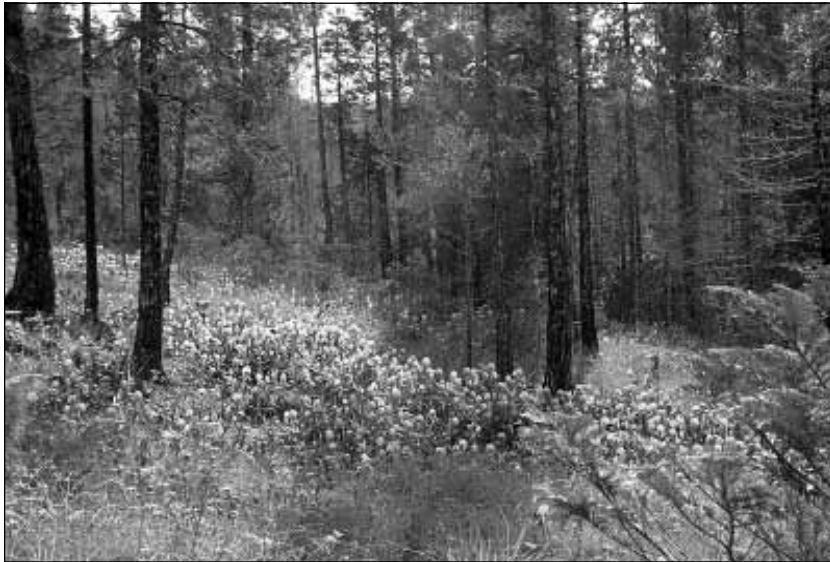
California pitcherplant beneath a canopy of Jeffrey pine on the upper slopes of Hunter Creek Bog.

to Hunter Creek Bog. There are two spring areas, one each on the north- and south-facing sides of the ridge. California pitcherplant and roundleaf sundew are both present. The soils are deep and water movement is not as well defined as in Hunter Creek Bog (Bowen and others 1982).