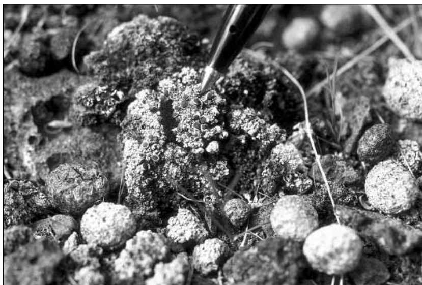
Woven-spored lichen ( Texosporium sancti-jacobi ), a rare cryptogam, lives on decomposing organic matter.

The Island has been a popular recreational destination since the homestead era. Prior to filling of the reservoir, there were several homesteads in the surrounding river canyons. Access to the top of the plateau was the same then as it is now: a single, steep, rocky trail on its southwest side. A 30-minute hike takes you to the top;