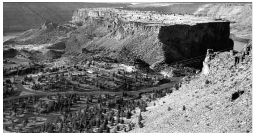
The Island in 1964. The newly constructed office and shop complex of The Cove Palisades State Park can be seen at the base of the plateau.

Just looking at The Island you can tell it is the result of some magnificent geologic event from the distant past. As with much of central Oregon, its geologic history is tied to volcanic activity, including basalt flows and deposits of ash, tuff, and coarse volcanic sand. An ancient basalt flow covered the landscape of central Oregon, forming extensive plateaus, into which the Deschutes, Crooked, and Metolius rivers cut deep canyons. Later, thin fluid basalt flowed north from the flanks of Newberry Crater (south of Bend), traveling 60 miles overland to spill into the ancestral Crooked River canyon above what is now Smith Rock State Park. This flow dammed the river, causing the water to form a lake where the present city of Prineville is located. Downstream, the basalt obliterated the Crooked River, flowing through its canyon and through the Smith Rock area. Continuing through the area of The Cove Palisades State Park, the basalt backed up both the Deschutes and Metolius river canyons near Pelton Dam, about nine miles north of The Island. These flows continued, filling the canyons almost to the brim. Once the flows cooled, the rivers began eroding down through weak spots in the flows, reclaiming their canyons. Over time, virtually all of this newer intra-canyon flow of basalt eroded, leaving The Island and some other scattered “hanging plateaus” as the only remnants of this great event (P. Patton, pers. comm.).