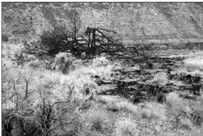
A fire, ignited on July 14, 1997, burned a juniper tree and crept through a small area dominated by big sagebrush and bluebunch wheatgrass. Today, only the aging remains of the juniper and an area dominated by cheatgrass indicate where the fire burned.

woody vegetation on The Island. During the last 30 years, perennial herbaceous species decreased from one-half of total cover to a little more than one-third, while shrub cover increased from one-third to two-fifths. The management plan for The Island includes a prescribed natural fire plan. If certain conditions are met (i.e., concerning weather, personnel and equipment), natural fire is allowed to burn, and monitored to prevent damage to resources outside the RNA, most importantly the Cove Palisades State Park facilities just below the rim.