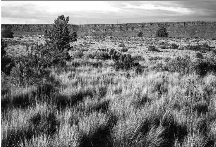
Native bluebunch wheatgrass community, looking northeast from the southern part of the RNA. In the foreground, scattered bitterbrush, big sagebrush and western juniper over a dense cover of bluebunch wheatgrass indicate a relatively recent wildfire. The background area of big sagebrush did not burn. BLM file photo.