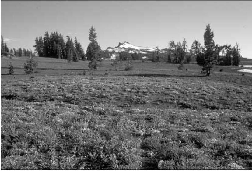
Pumice slope west of Llao Rock, with Hillman Peak in the background. Foreground vegetation is primarily spreading phlox ( Phlox diffusa ) and Newberry knotweed ( Polygonum newberryi ).

Wizard Island while conducting boat tours. Brown encouraged Jackson and another seasonal naturalist, Adolph Faller, to study vegetation patterns on the volcanic island in 1966. Jackson returned again in 1969. Jackson and Faller spent their lieu days on the island, taking the morning tour boat to the island and returning on the last trip of the day. They described five different plant communities on the island: cinder slope, crater rim, lower cone, north slope, and lava flow (Jackson and Faller 1973). In addition, Jackson conducted a floristic survey, recording 106 species on the volcanic island, including 33 not previously noted (Jackson 1973). Looking back, Jackson commented on what could be accomplished with little funding or grant support (M. Jackson, pers. comm.).