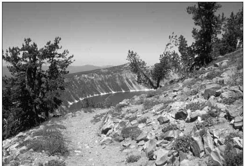
Mountain hemlock ( Tsuga mertensiana) and whitebark pine ( Pinus albicaulis) along Garfield Peak Trail.