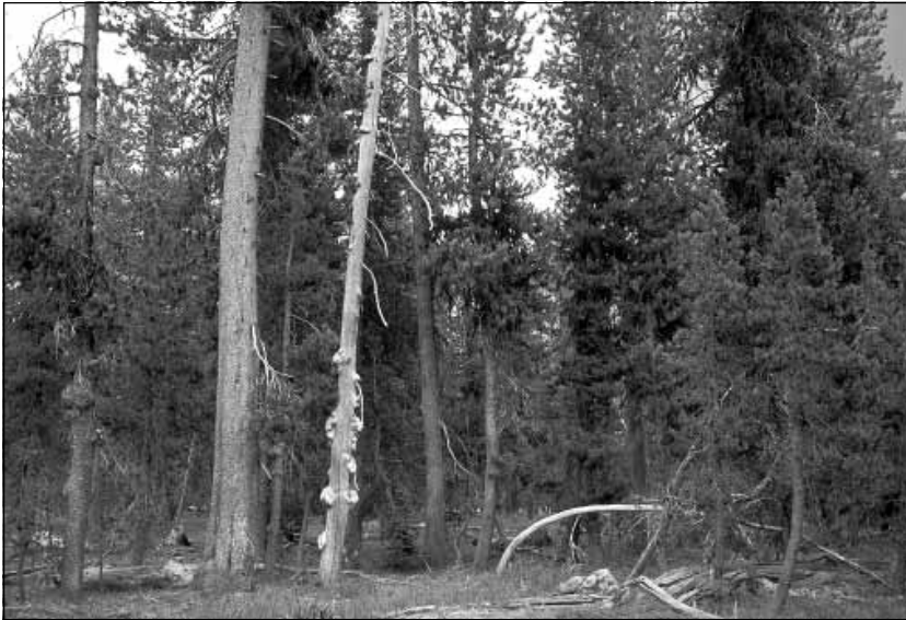
Lodgepole pine ( Pinus contorta) forest in Munson Valley.