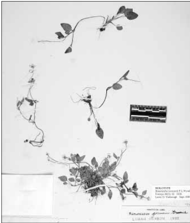
Herbarium sheet of Wynd's holotype for Ranunculus terrestris collected at Red Blanket Creek, CLNP. Lyman Benson annotated the specimen as Ranunculus gormanii Greene in 1932.

1941). Within the Canadian Zone, diversity is contributed by environments such as streamsides, pumice flats (the Pumice Desert), and islands (Wizard Island and Phantom Ship). Comparable variation in the Hudsonian Zone is found in open pumice slopes around the rim, streamsides, talus slopes, and wet areas.