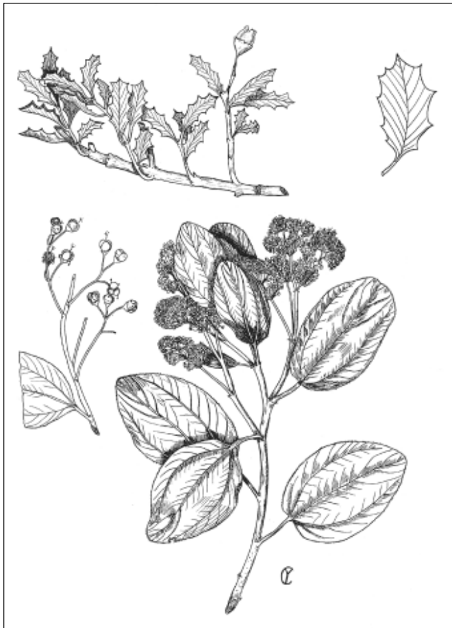
Mahala mat ( Ceanothus prostratus ) and snowbrush ( Ceanothus velutinus ) illustrated by Charles Yocom. Reprinted from Shrubs of Crater Lake National Park .