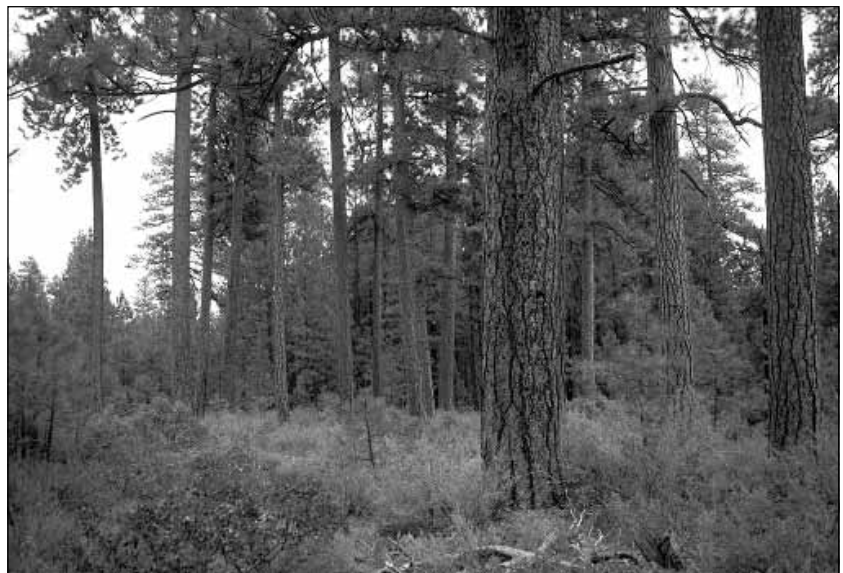
Ponderosa pine forest with understory of snowbush ( Ceanothus velutinus) and sagebrush ( Artemisia tridentata) found in the southeast and northeast corners of CLNP.