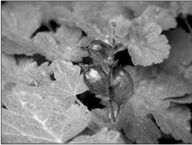
Crater Lake currant ( Ribes erythrocarpum ) is a narrow endemic found only in a few Oregon counties and was first collected by Coville and Leiberg in 1896. It is an intermediate host for the blister rust on whitebark pine.

Coville's description reveals that generally, the vegetation has changed little since 1897: