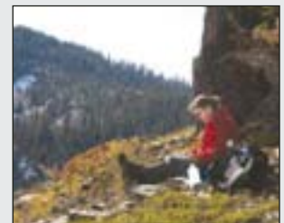
Editor with proofs and red pen at Sky Lakes Wilderness.