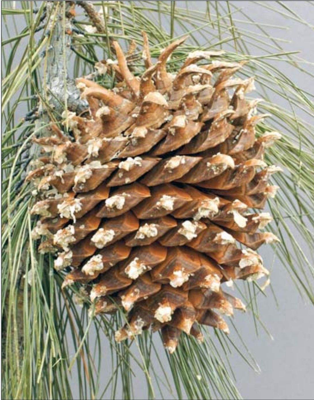
Cone of gray pine ( Pinus sabiniana )

Journal of the Native Plant Society of Oregon