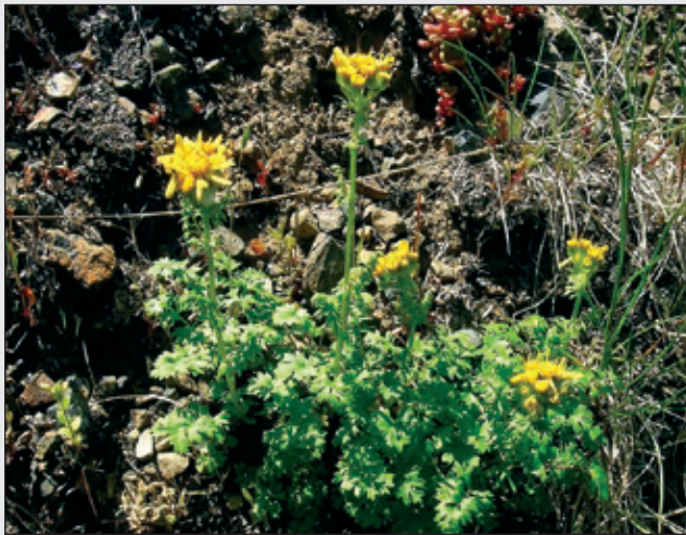
Flett's groundsel ( Packera flettii, formerly Senecio flettii) has a limited distribution in the Coast Range, Willapa Hills and Olympics. Curiously, it has not been seen on Saddle Mountain. on Angora Peak.