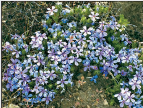
Phlox douglasii.