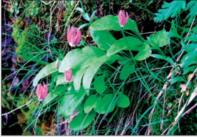
Frigid shooting-star ( Dodecatheon austrofrigidum ) was described by Ken Chambers in 2006 from specimens collected in Tillamook County. on Saddle Mountain.