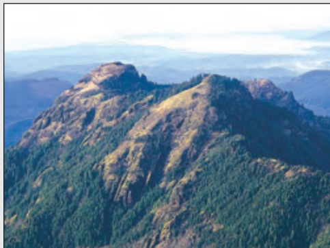
Saddle Mountain.