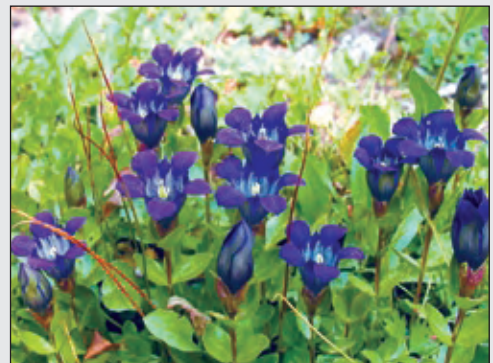
Mountain gentian ( Gentiana calycosa) in the Lostine Valley.