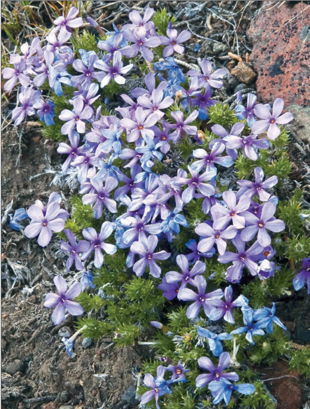
Columbia Phlox ( Phlox douglasii )

Journal of the Native Plant Society of Oregon