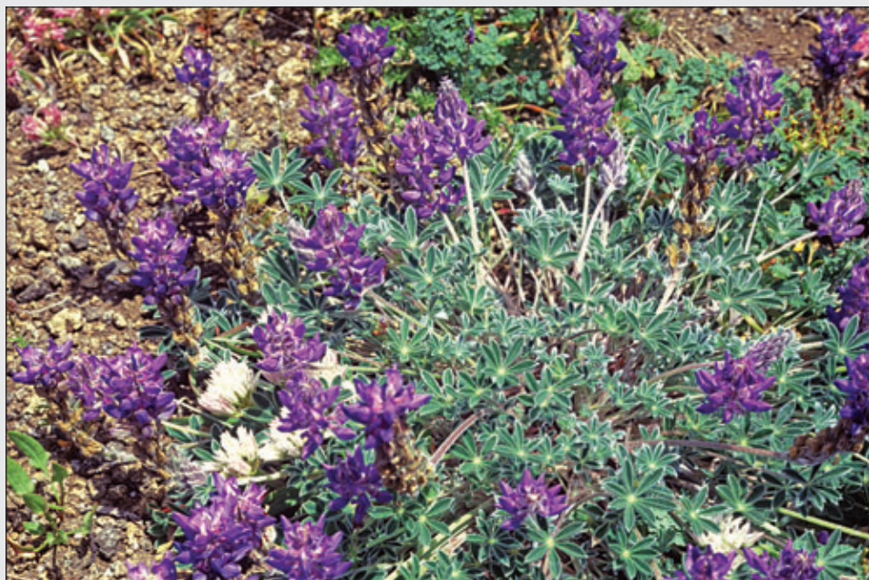
Lupinus lepidus var. lobbii at the Marys Peak rock garden. This species is common east of the Cascades but is found only at a very few places in the Coast Range.