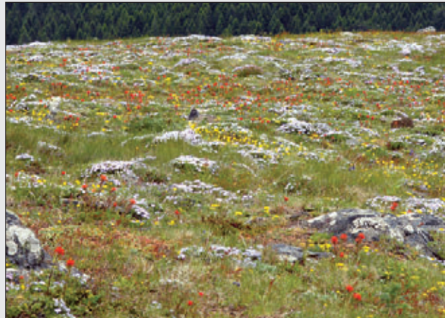
Wildflower display at the summit of Marys Peak.