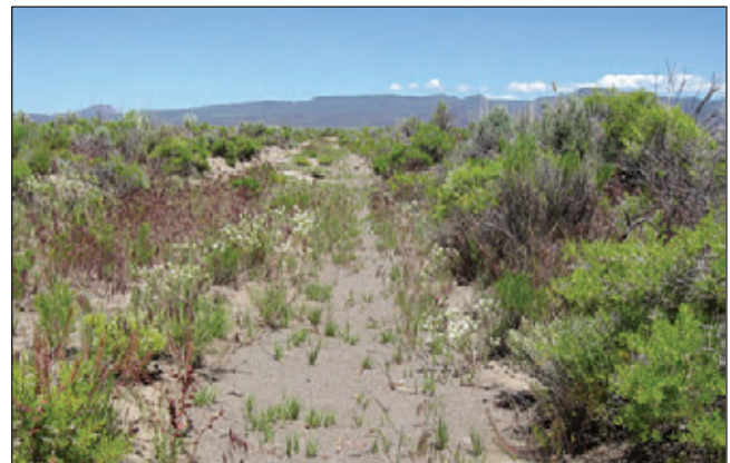
Pueblo Valley peppergrass in sand dunes south of Fields, Oregon. Photo by Marilyn McEvoy.

Cover Photo: Brown's Peony ( Paeonia brownii ) on Antelope Mountain, photographed by Norm Jensen on June 25 during the 2011 NPSO Annual Meeting.