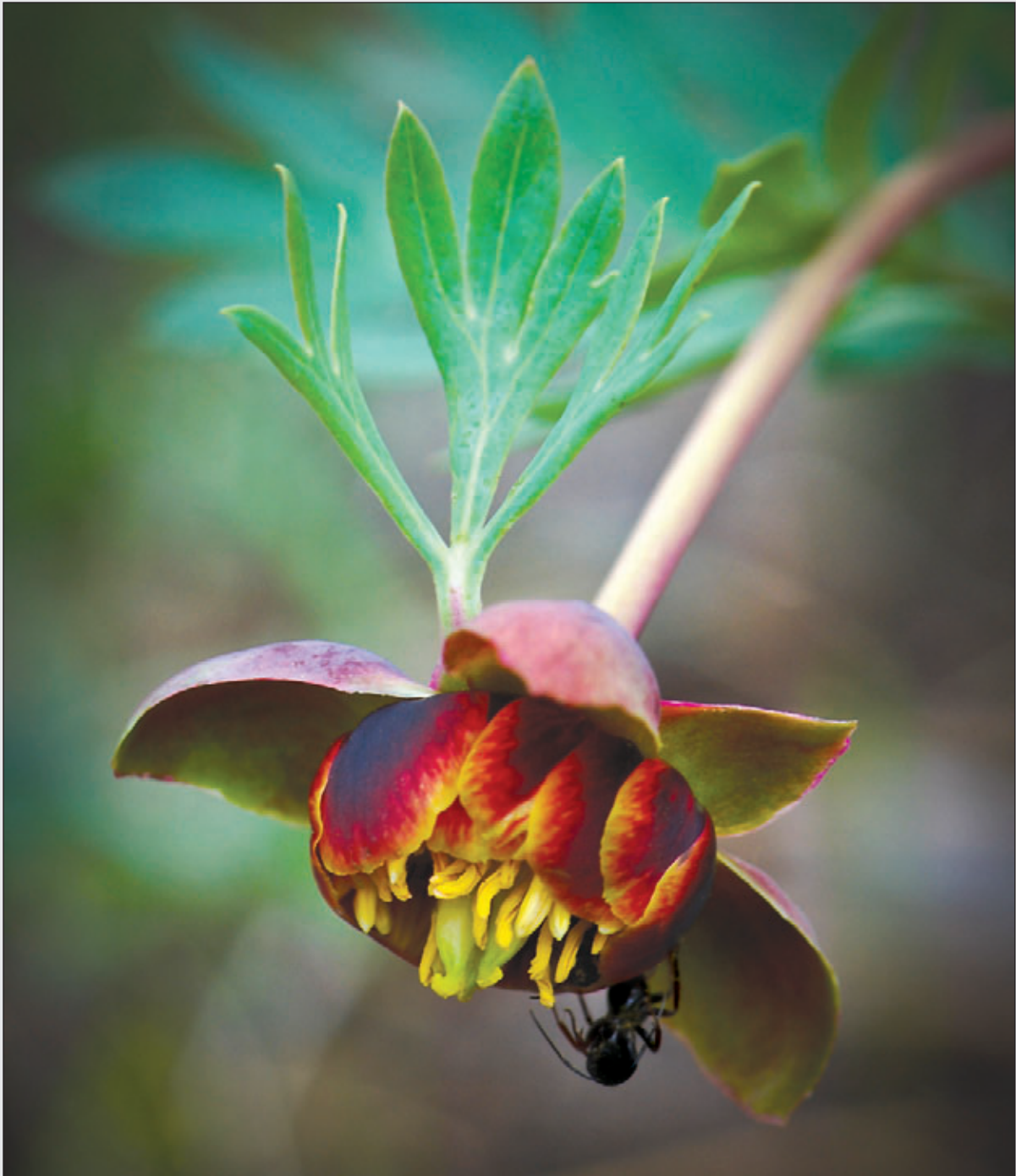
Brown's Peony ( Paeonia brownii )

Journal of the Native Plant Society of Oregon