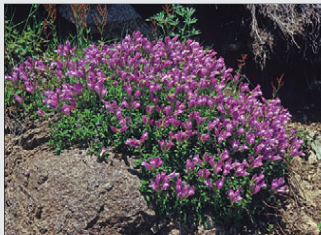
Penstemon cardwellii at the top of Marys Peak.