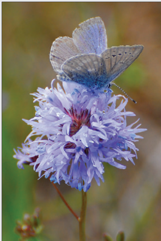
Boisduval's blue ( Plebejus icaroides ) on Gilia capitata .