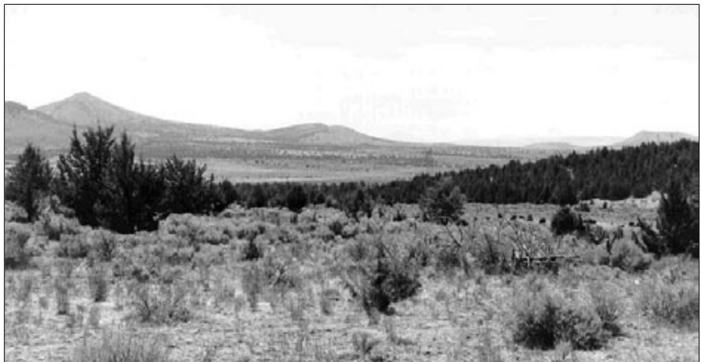
These photos were taken from essentially the same location on the Crooked River National Grassland. Top photo was taken in 1905 and shows a farming operation with the homestead in the lower center of the photo, at the site of a spring. Western juniper exists as scattered trees on the ridge in the near background. Ninety years later, bottom photo shows the same scene in 1995. The ridge is virtually covered with trees, as are the buttes in the far background. Western juniper has even invaded the long-abandoned tilled ground, and the spring is gone.