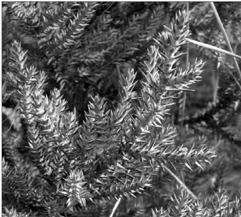
The leaves of trees generally younger than 25 years old are noticeably longer and grayer in color than those of the mature trees. Feb. 20, 2013, near Prineville.

If your sole experience with western juniper has been a blur in the background during your sub-sonic drive from Bend to Burns in search of that special Eriogonum , hopefully you gained some knowledge by reading this article. This important native Oregon plant has its place, but its ongoing increase across the landscape definitely presents challenges. These challenges, of course, have led to research studies designed to halt its advance and restore damaged ecosystems. Consideration of these topics is left for a later chapter. Now that you have a better appreciation for western juniper, on your next hike, take a moment to ponder that tree before you and appreciate it for more than just its shade. How old is it? What do the cones look like? Would I have found this tree here 200 years ago? What other species depend on it for their survival?