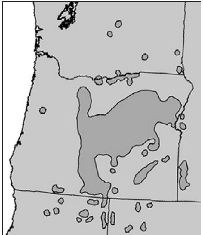
The current range of western juniper ( Juniperus occidentalis var. occidentalis ) (USGS 2013).

The leaves of mature trees are scale-like, and usually no more than a tenth of an inch in length. These scales overlap each other on the stem as opposite pairs