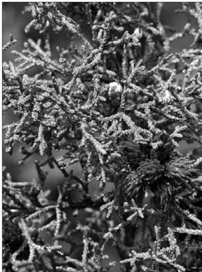
This branch is predominantly male, as evidenced by the proliferation of male cones, but a few female cones are also present, as well as the moth-induced galls. Feb. 20, 2013, near Prineville.

Gedney and others (1999) found western juniper on sites where the mean annual precipitation exceeded 30 inches and on sites with as little as five inches. Elevation ranged from about 1,000 feet up to 8,000 feet. The Oregon Flora Project data contains a record of western juniper from a site only 223 feet in elevation, and the species also occurs along the Columbia River near Mosier at 100 feet elevation (Frank Callahan, pers. comm.). Gedney and others (1999) reported western juniper on soil series within all 18 soil classes found in eastern Oregon ( http://soils.usda.gov/technical/classification/taxonomy/ ), as well as on 10 associated vegetative-topographic land forms ( e.g. , basins and valleys, grass-shrub uplands, lava flows).