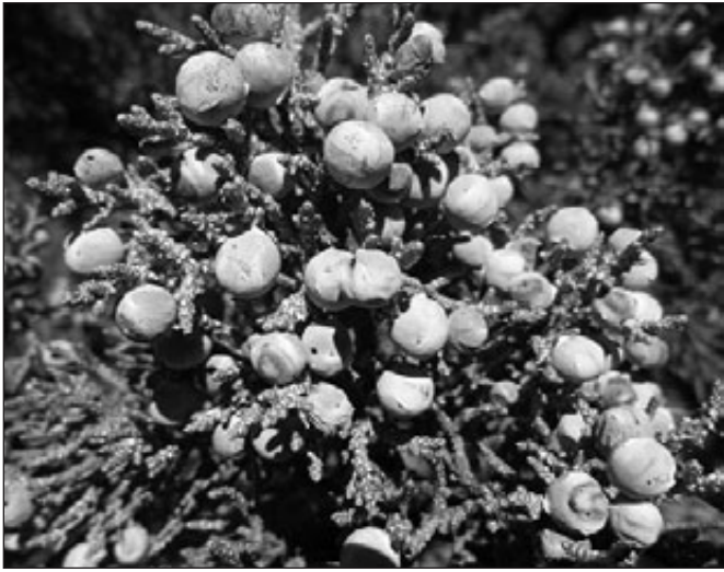
Female cones of western juniper. Photo taken Feb. 15, 2013, west of Redmond.

trees (under 25 years) appear so unjuniper-like that the novice can easily mistake them for an entirely different plant. I once witnessed a seasoned BLM range conservationist bait a cadre of fresh-faced summer range technicians into identifying a four-inch juniper as a phlox.