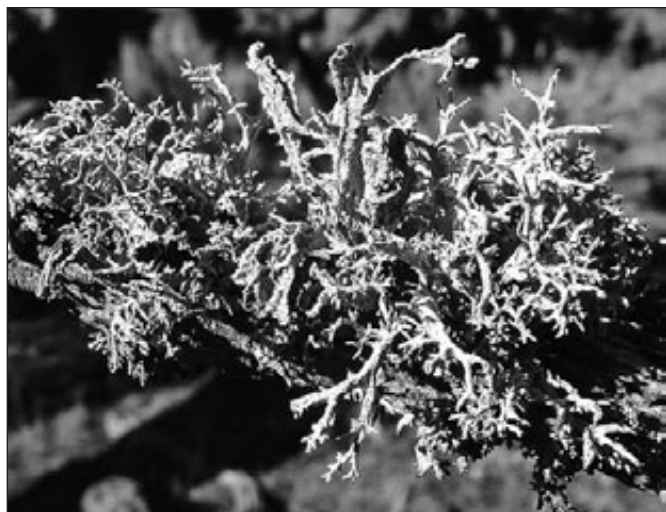
The colorful chartreuse lichen, Letharia vulpina , commonly grows on dead branches of older western juniper trees. Photo taken by author, Feb. 15, 2013, west of Redmond.

Using a 1988 survey of the extent of western juniper in eastern Oregon, Gedney and others (1999) looked at occupied habitats and concluded that ideal conditions for western juniper are sites with annual precipitation of 10 to 15 inches, an elevation ranging from 4,000 to 5,000 feet, arid-xeric or xeric-arid soils, and landform positions of terraces and flood plains, or plateaus and uplands. Those are apparently optimal conditions, but under current land management practices, western juniper is a master in establishing itself under a wide variety of environmental conditions.