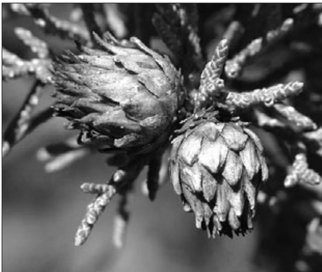
Galls caused by a wasp are often mistaken for female cones. Photo taken by author, Feb. 15, 2013, west of Redmond.

The end of pollination is a time of celebration throughout eastern Oregon, because for many Oregonians, juniper pollen is a severe spring allergen (Pollen Library 2013). However, the physical act of a tree releasing its pollen is remarkable. Once, a