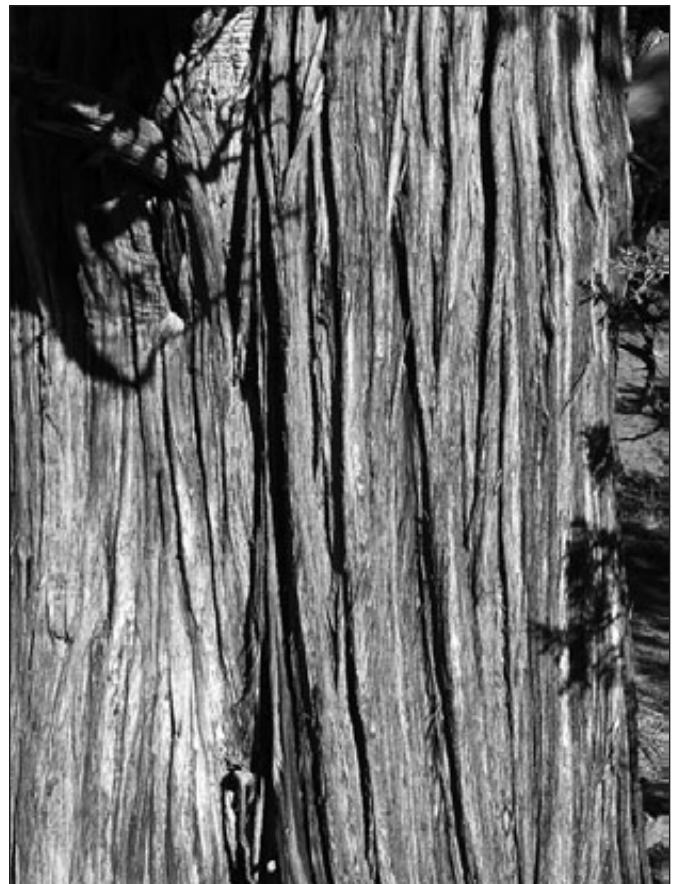
The bark of an older western juniper is usually furrowed. Photo taken by author, Feb. 15, 2013, west of Redmond.

Many trees have growths that appear to be cones, but are actually insect galls formed by larval infestation of a branchlet. Midge larvae ( Walshomyia spp.) and moth larvae ( Heinrichsia sanpetella ) have both been documented from these galls (Purrington and Purrington 1995). A colleague once came to me during a field trip, embarrassed and red-faced, admitting that for years she had told people these galls were the female cones of western juniper.