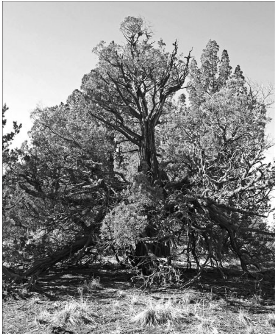
A typical ancient western juniper, showing the rounded, partially dead crown, dead and broken branches, and an abundance of the lichen Letharia vulpina . Photo taken by author, Feb. 15, 2013, west of Redmond.

Another trait that confers a competitive advantage to western juniper lies in how its seeds are disseminated. Beyond the usual methods of gravity, wind, and water, juniper “berries” are favored by a number of birds ( e.g. , American Robin ( Turdus migratorius ), Cedar Waxwing ( Bombycilla cedrorum ), Pinyon Jay ( Gymnorhinus cyanocephalus ) and Townsend’s Solitaire ( Myadestes townsendi )), especially in the winter. After feeding, the birds find a suitable perch to process their meal, where the seeds pass through the gut and are eliminated. Later they germinate where dropped, as evidenced by lines of young junipers along fences. Birds often perch on shrubs, especially sagebrush ( Artemisia spp.), where there is a further advantage to juniper in that the seed finds itself in a