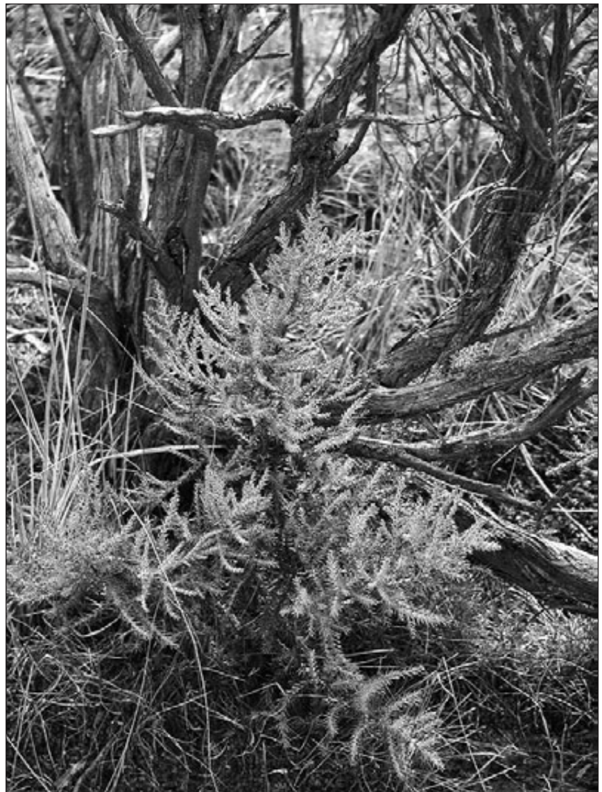
A young western juniper is nurtured within the protective confines of a mature big sagebrush ( Artemisia tridentata ). Photo taken by aurhot, Feb. 20, 2013, near Prineville.

Western juniper has a competitive edge in both disturbed and relatively undisturbed environments. Once it has put a taproot down to a dependable source of water, the tree produces lateral roots, forming an extensive mat of fibrous roots close to the soil surface. These lateral roots normally extend out for at least a distance equaling the height of the tree, but can extend to three times the tree height (Miller et al. 2005).