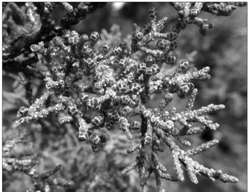
Immature male cones of the western juniper. Within a couple of months these cones will have released their pollen and, by late summer, will have dropped from the tree. Photo taken by author, Feb. 20, 2013, near Prineville.

or in whorled groups of three, so what the lay person might call a juniper leaf is actually a number of tiny leaves overlapping each other along the entire length of a branchlet. Each leaf also has a resinous ridge, resulting in an overall stickiness. In contrast, leaves of young junipers are long and needle-like. In fact, young