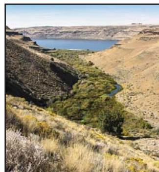
Cover Photo: Juniper Canyon is part of the McNary National Wildlife Refuge in Umatilla County, Oregon.