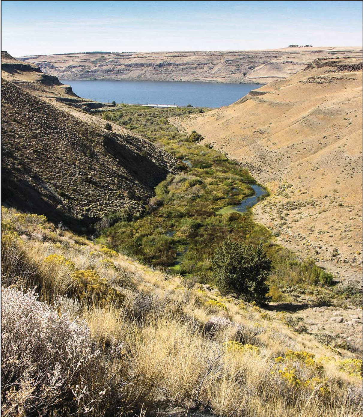
Juniper Canyon, Umatilla County, Oregon.

Journal of the Native Plant Society of Oregon