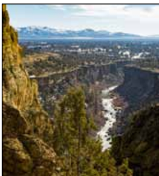
Cover Photo: Crooked River Canyon from Smith Rocks. Photo by Robert C. Korfhage, February 2017.