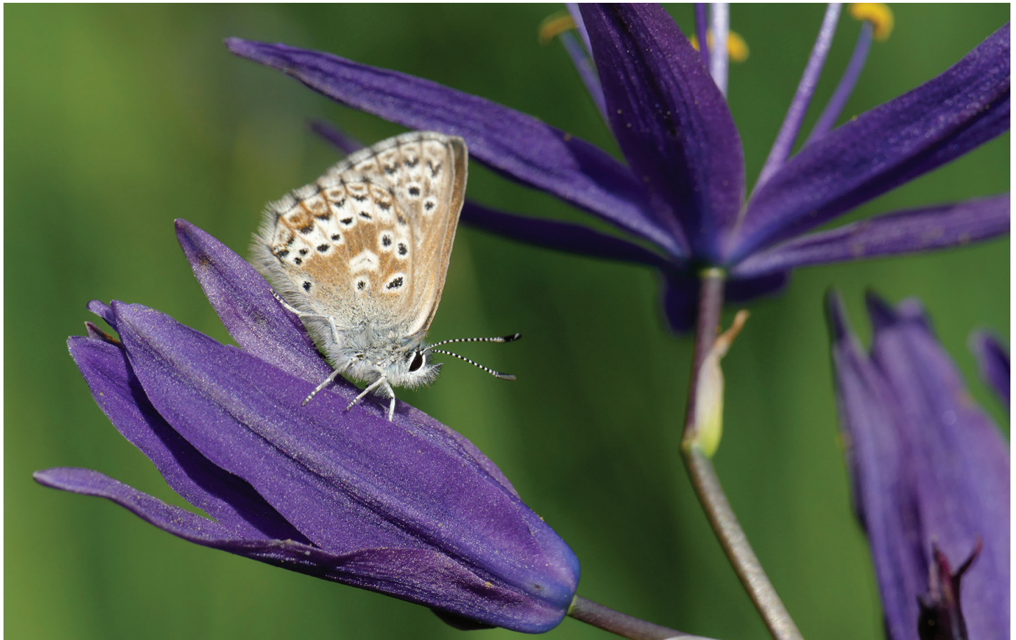
The Sierra Nevada blue ( Agriades podarce) is an uncommon butterfly of wetlands in the southern Cascades. Their caterpillars feed exclusively on species of shooting star ( Dodecatheon jeffreyi and D. alpinum). Here a female is nectaring on great camas ( Camassia leichtlinii) in the Calapooya Mountains.