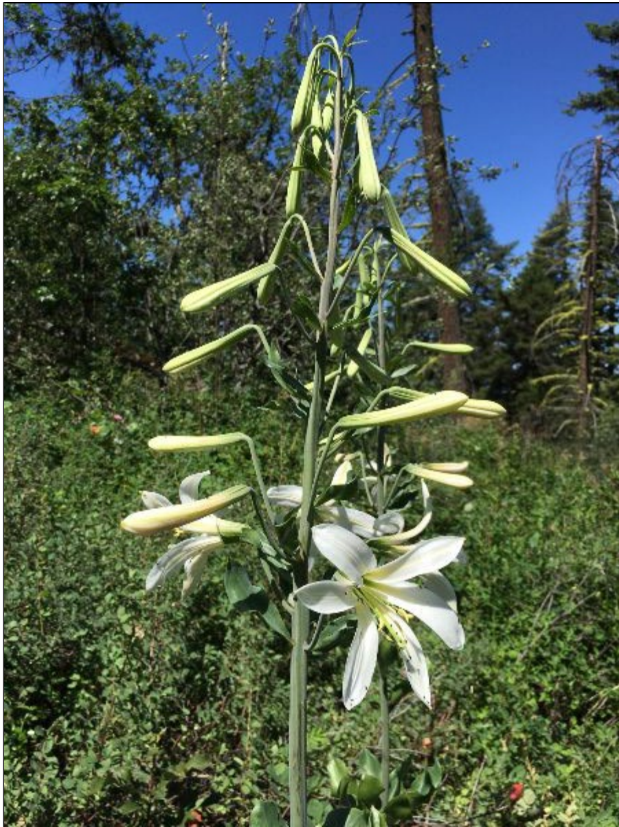
Cascade lily ( Lillium washingtonianum ) on Green Springs Mountain loop. June 22, 2021.