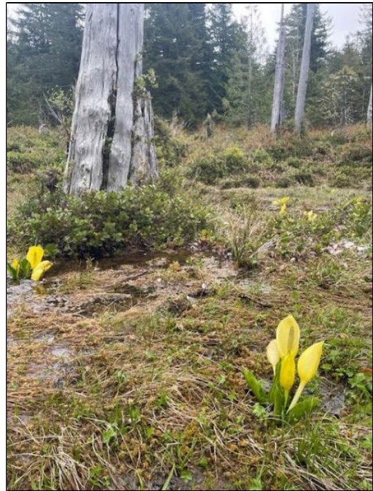
Elegant fawn-lily ( Erythronium elegans ) (left photo) and skunk cabbage ( Lysichiton americanus ) (right photo) along Mt. Hebo trail, on the border of Tillamook and Yamhill counties, Oregon. May 17, 2024. Photographed by Marina Longden during a 2024 NPSO Annual Meeting field trip.