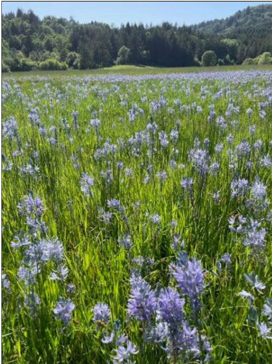
Common camas ( Camassia quamash) at Deer Creek County Park in Yamhill County, Oregon. May 17, 2024.