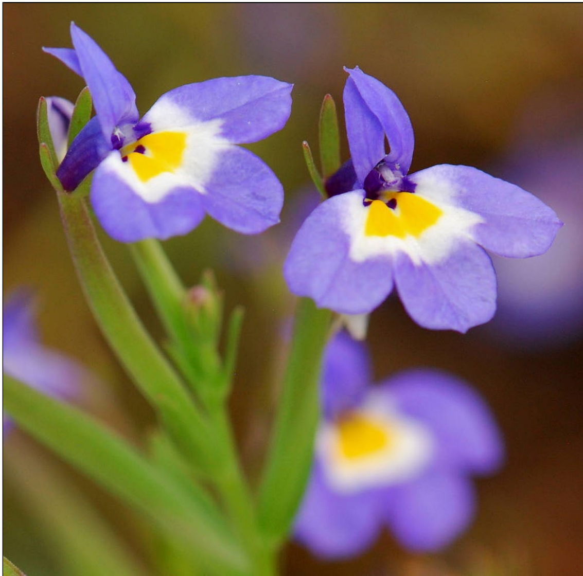
Cascade downingia ( Downingia yina ). Josephine County Oregon. June 14, 2011.